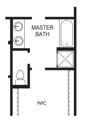
OPTIONAL 36"x 60" TUB & 36"x 36" SHOWER