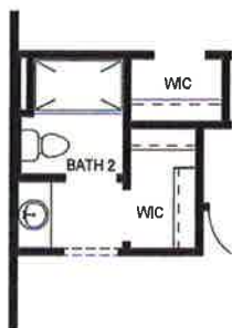
OPTIONAL BATH 2