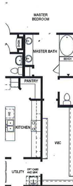
OPTIONAL MASTER BATH 60"X42" TUB AND 42"X42" SHOWER