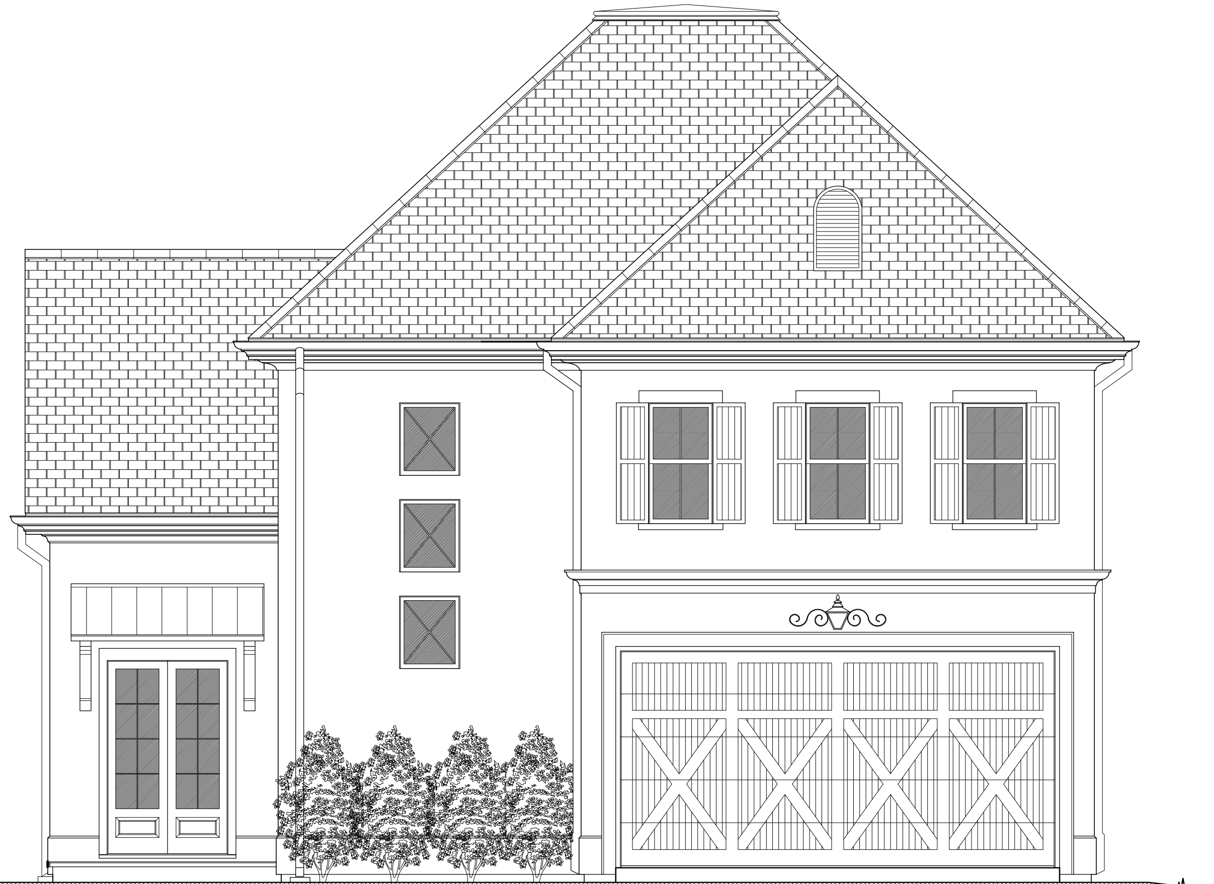
1 FRONT ELEVATION 1/4"=1'-0"