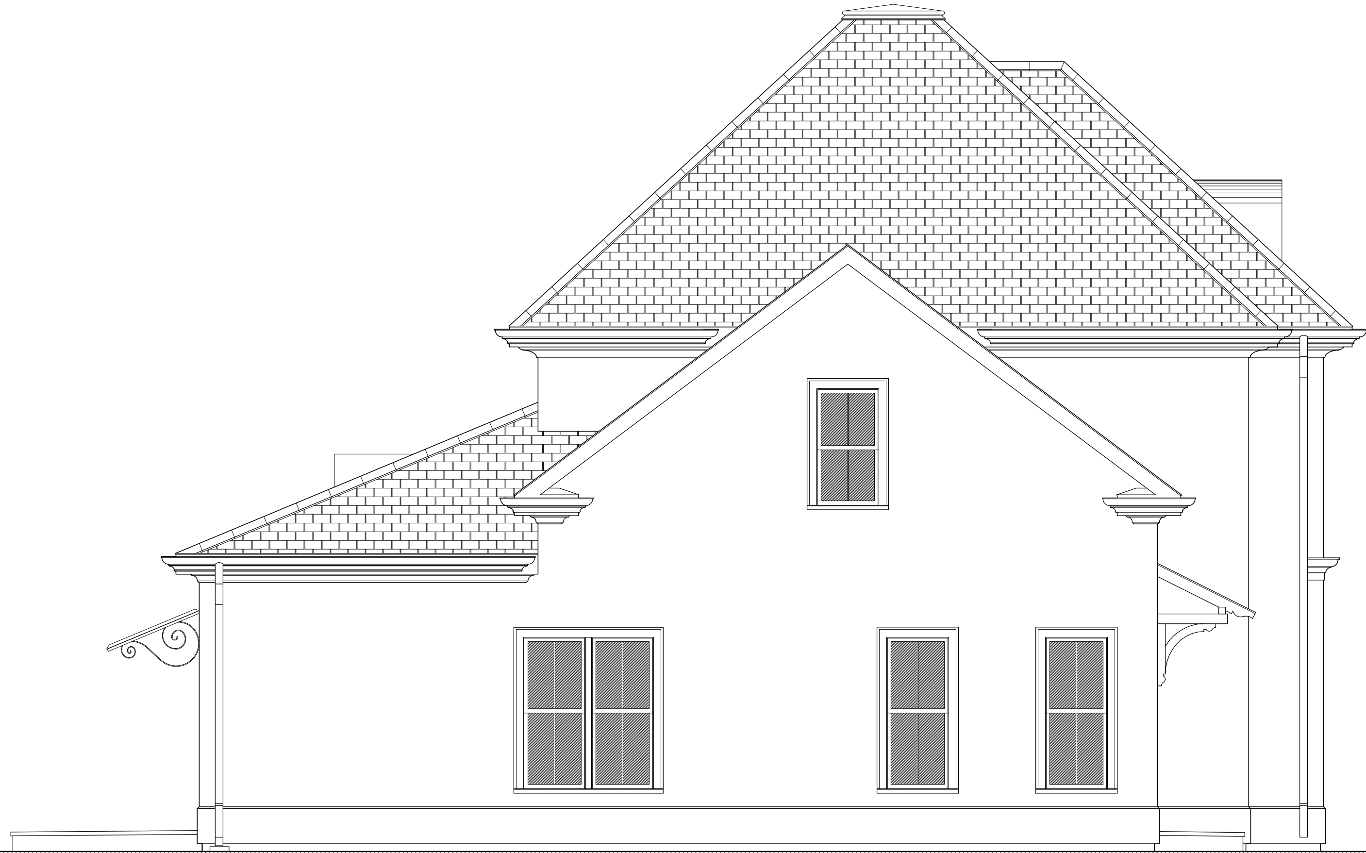
2 LEFT ELEVATION 1/4"=1'-0"