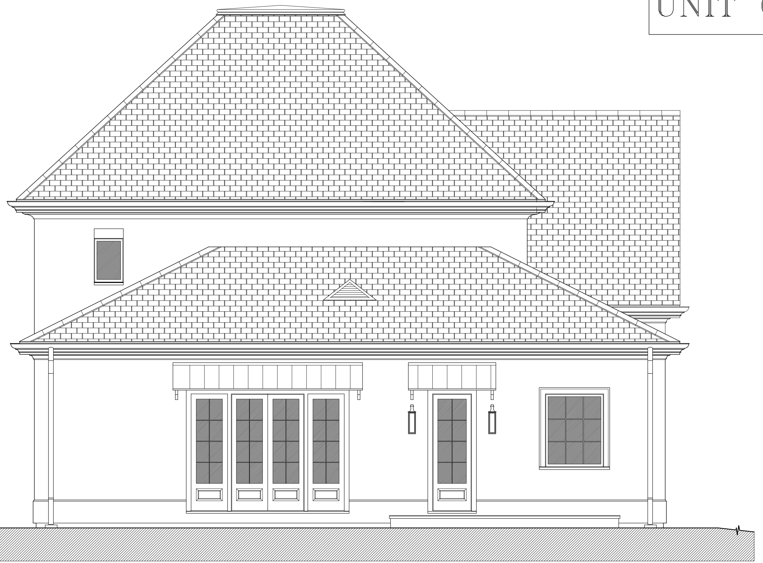
3 REAR ELEVATION 1/4"=1'-0"