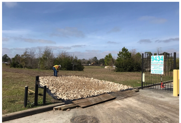
Stabilized Construction Entrance at W140 Detention Basin