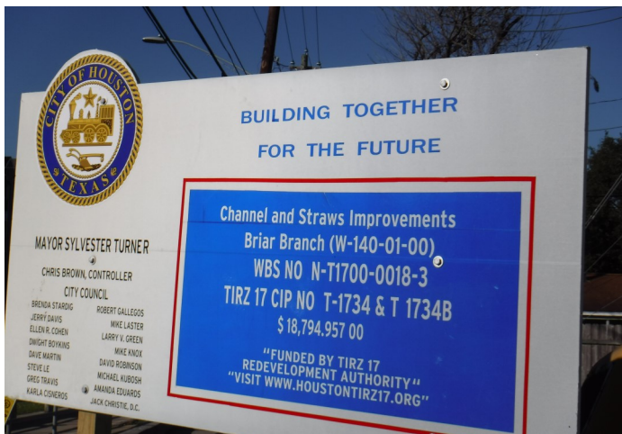
Project Sign Installed