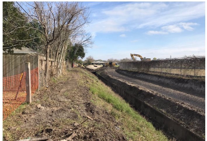
South Access Road