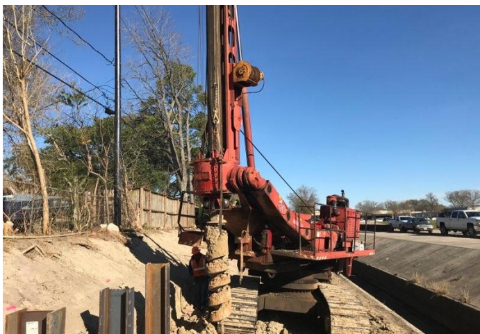
Temporary Shoring Installation