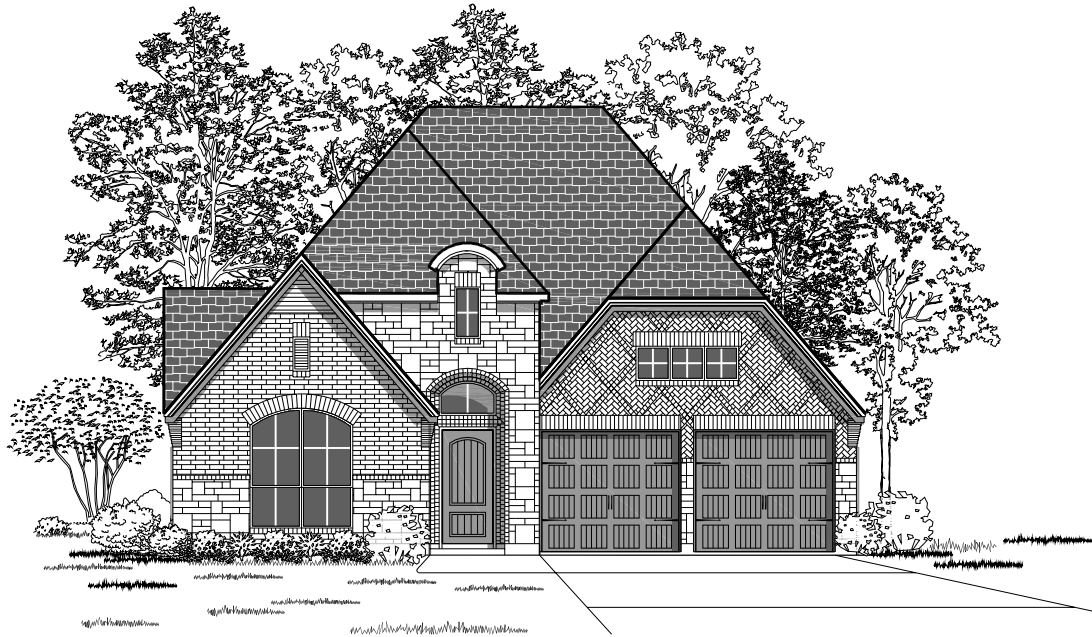
Design 2251W E-70

This design, as originally designed and prior to any changes you make, is estimated to yield approximately the number of square feet shown on page 1. All dimensions are approximate. Square footage may vary based on as-built dimensions, configurations, plan options and/or the method of calculation. Designs are not-to-scale, and are conceptual illustrations that may differ from construction plans or completed improvements. A design may depict features not available on all homesites or in all communities. Perry Homes reserves the right to make changes in plans and specifications, and to substitute material of similar quality. Prices, terms, promotions, plans, dimensions, features, options, amenities, elevations, designs, square footages, specifications, materials, and availability of homes or communities are subject to change without notice or obligation. All obligations will be governed by a written contract. This design does not constitute a commitment to build a particular floor plan or home in any given community. Some floor plans, options, and/or elevations may not be available on certain homesites or in a particular community and may require additional charges. Please check with Perry Homes to verify current offerings in the communities you are considering. This rendering is the property of Perry Homes, LLC. Any reproduction or exhibition is strictly prohibited.