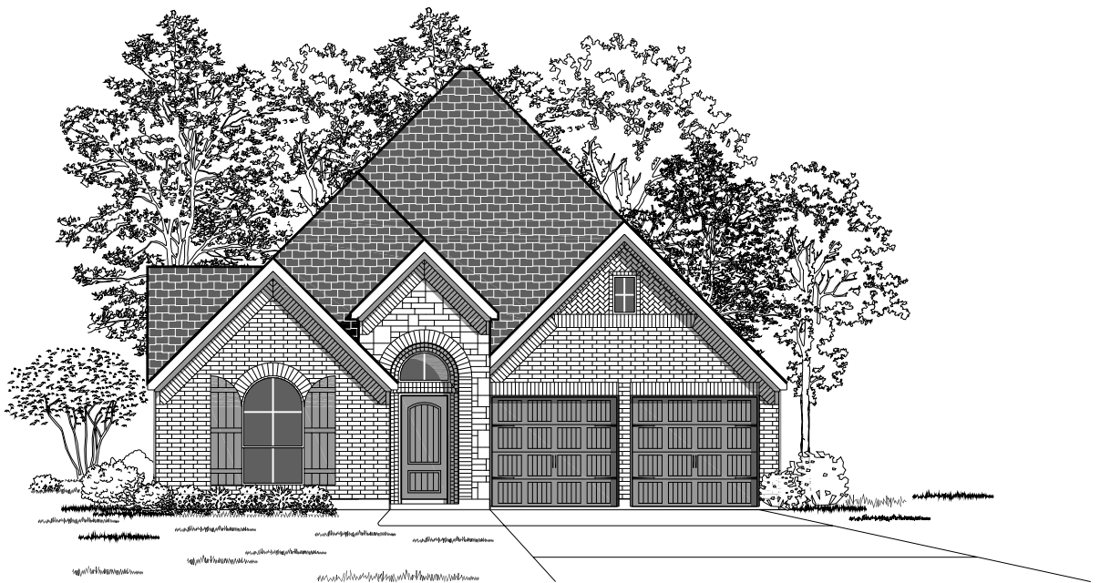
Design 2251W E-30

This design, as originally designed and prior to any changes you make, is estimated to yield approximately the number of square feet shown on page 1. All dimensions are approximate. Square footage may vary based on as-built dimensions, configurations, plan options and/or the method of calculation. Designs are not-to-scale, and are conceptual illustrations that may differ from construction plans or completed improvements. A design may depict features not available on all homesites or in all communities. Perry Homes reserves the right to make changes in plans and specifications, and to substitute material of similar quality. Prices, terms, promotions, plans, dimensions, features, options, amenities, elevations, designs, square footages, specifications, materials, and availability of homes or communities are subject to change without notice or obligation. All obligations will be governed by a written contract. This design does not constitute a commitment to build a particular floor plan or home in any given community. Some floor plans, options, and/or elevations may not be available on certain homesites or in a particular community and may require additional charges. Please check with Perry Homes to verify current offerings in the communities you are considering. This rendering is the property of Perry Homes, LLC. Any reproduction or exhibition is strictly prohibited.