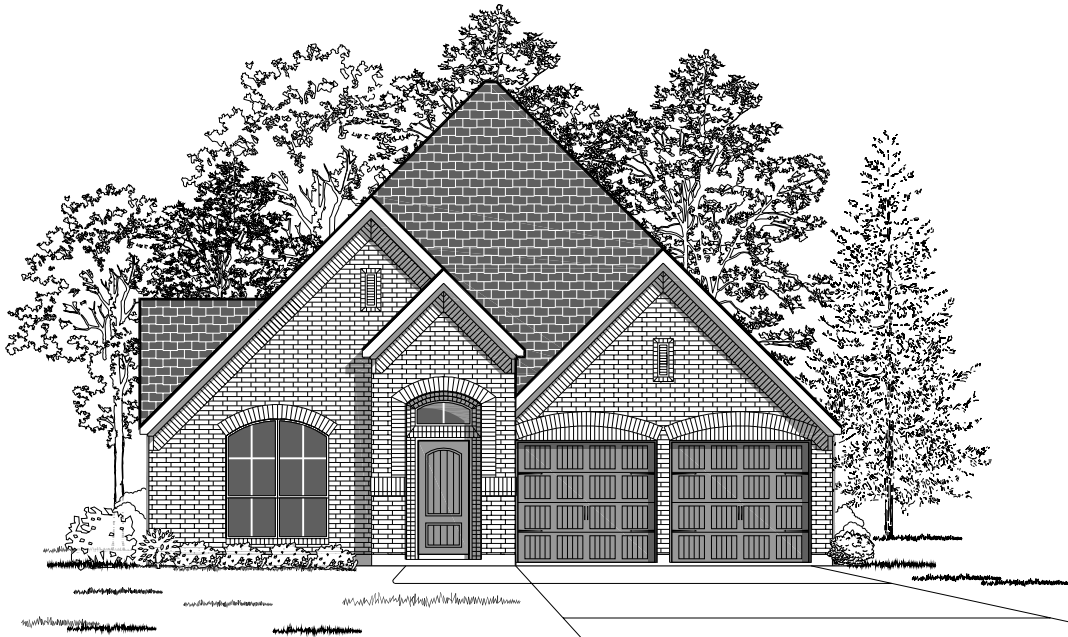
Design 2251W E-1