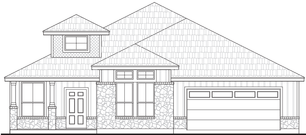
PLAN 2172 "A" ELEVATION