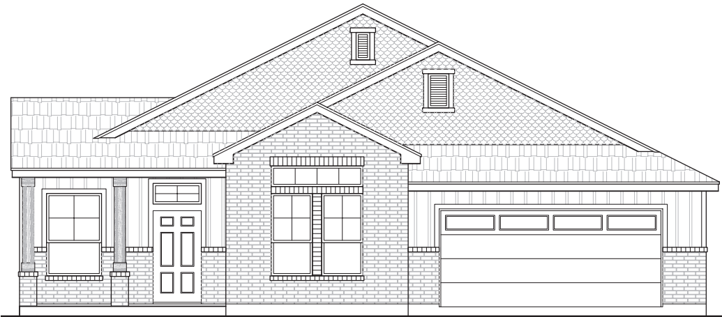
PLAN 2172 "B" ELEVATION

2,172 SQ. FT. • 3 BED • 2.5 BATH • STUDY • 2 CAR GARAGE