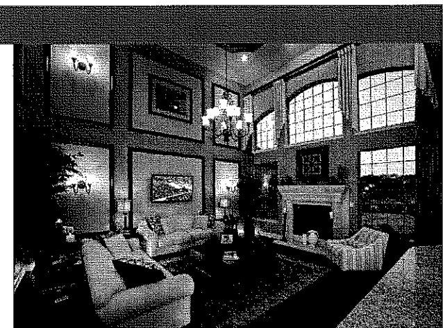
TWO-STORY FAMILY ROOM