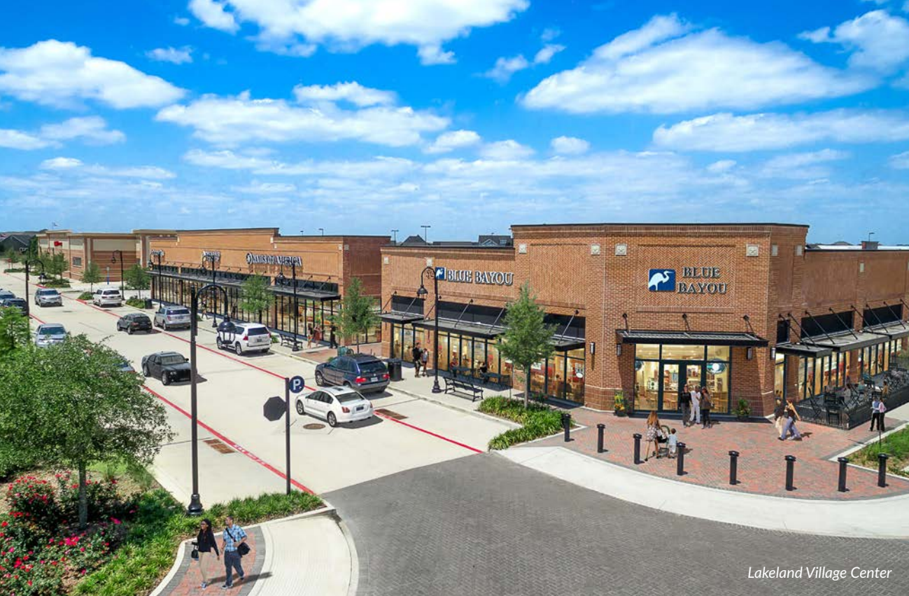
Lakeland Village Center