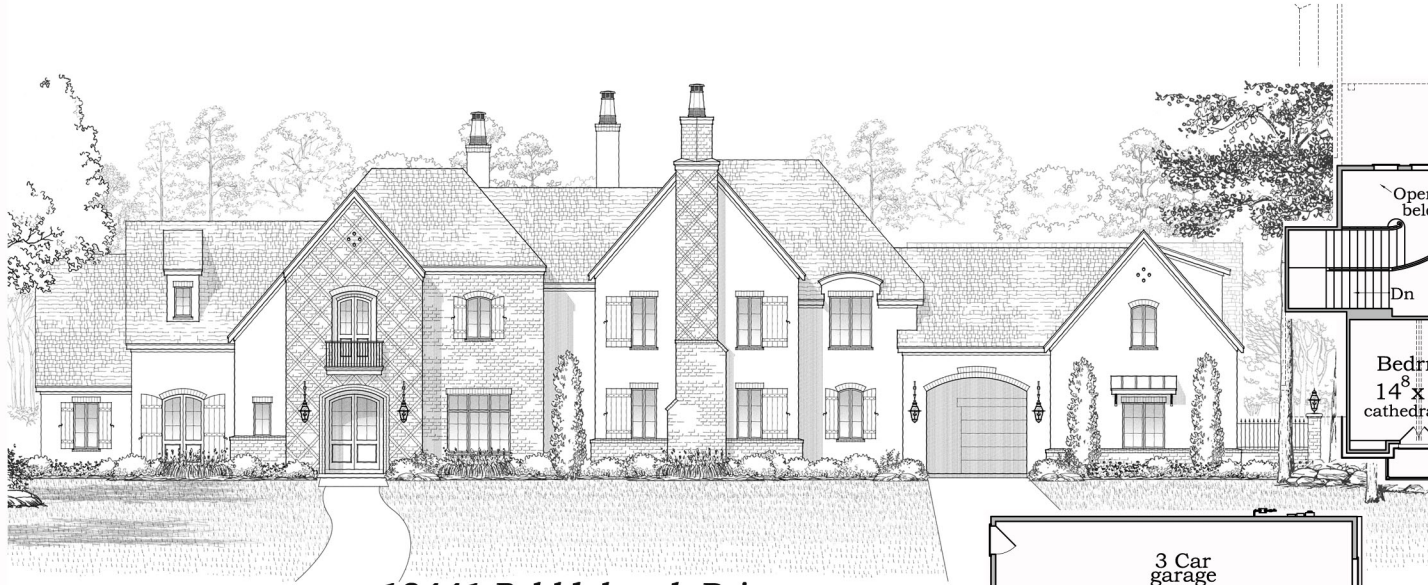
12441 Pebblebrook Drive