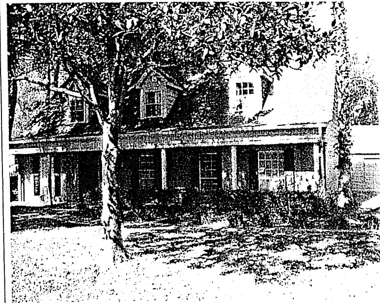
South Side and East Side of House (01/13/2016)