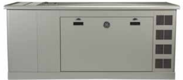
48kW 1 Home Generator System

To learn more, visit www.ge.com/generatorsystems