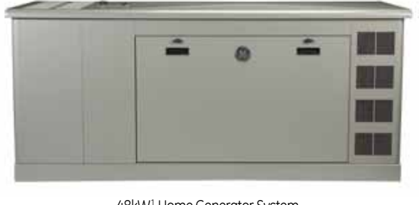
48kW<sup>1</sup> Home Generator System