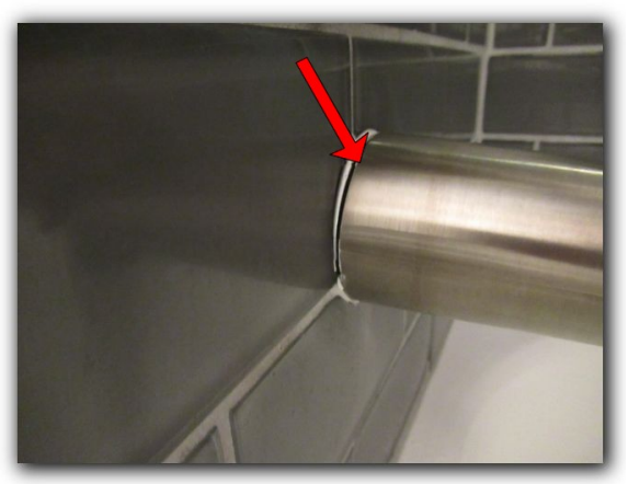
Lack of Insulation on Water Supply Lines

There is a lack of insulation on the water supply lines within the attic space. Improvements should be undertaken to avoid damage to the pipes in freezing weather, which can also result in interior water damage to the home as well.