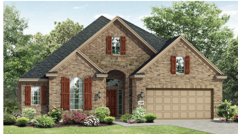
ELEVATION B (SHOWN W/ OPT. STONE)