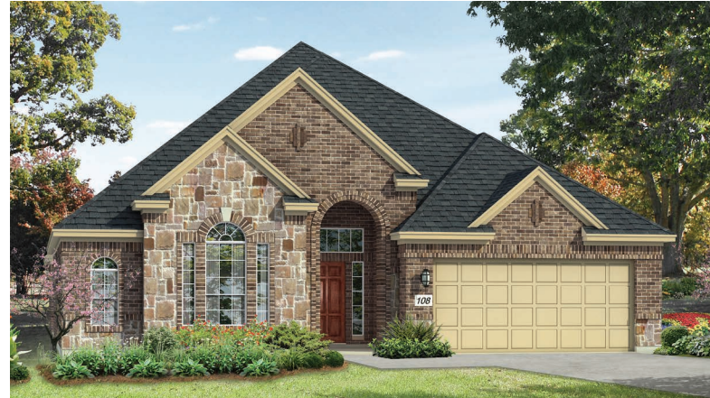
ELEVATION A (SHOWN W/ OPT. STONE)