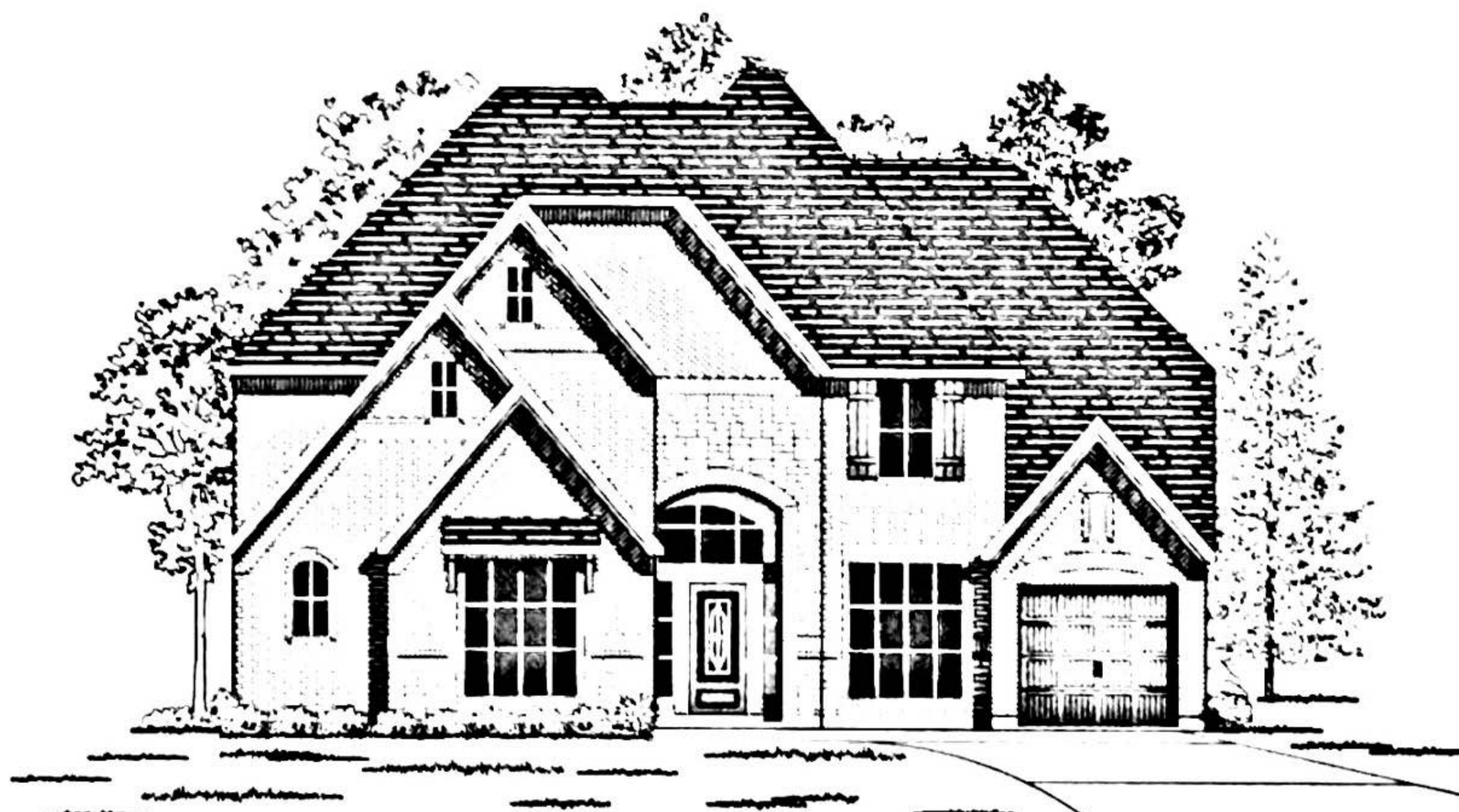
Design 3790W E-30