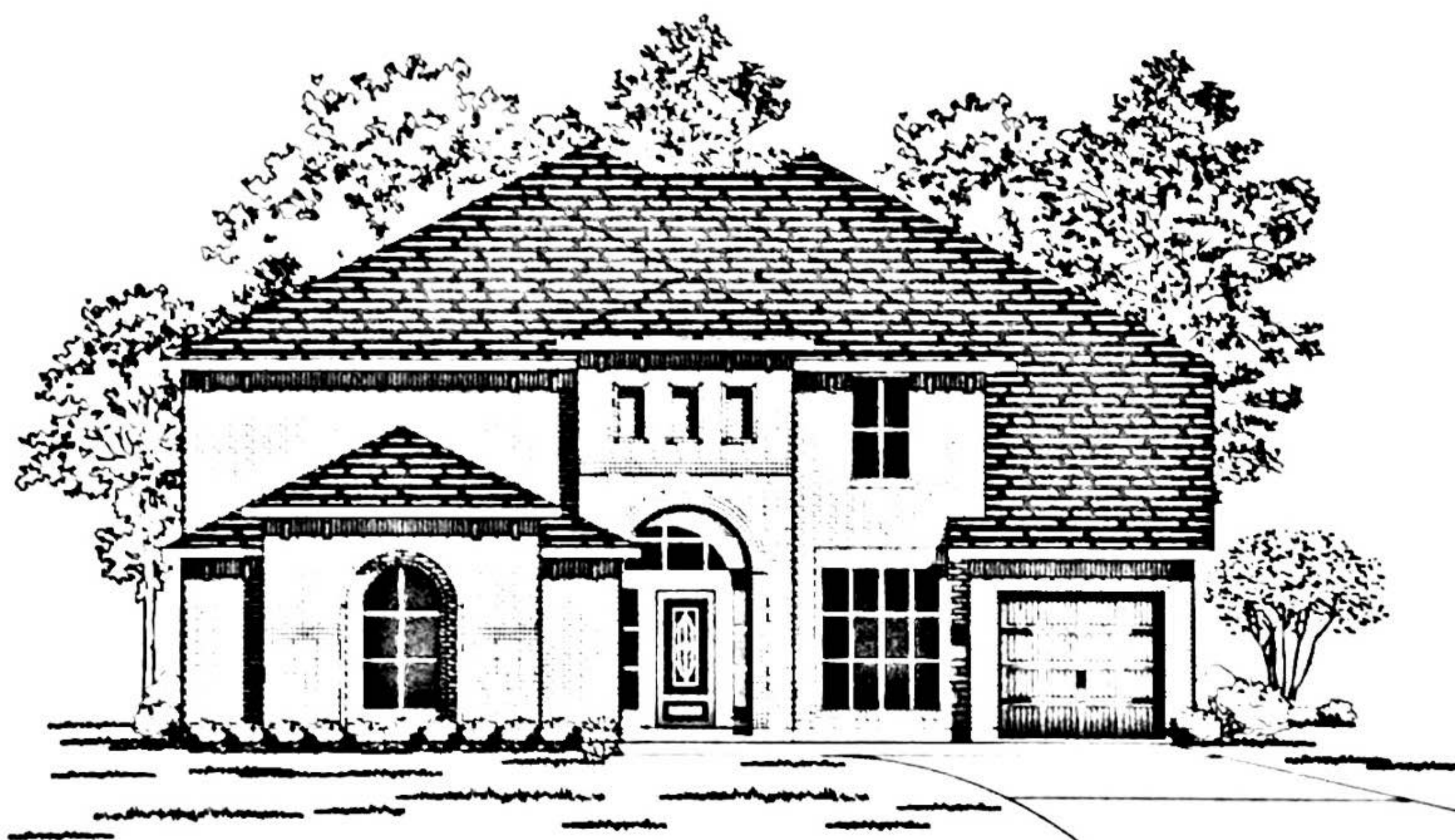
Design 3790W E-50

This design, as originally designed and prior to any changes you make, is estimated to yield approximately the number of square feet shown on page 1. All dimensions are approximate. Square footage may vary based on as-built dimensions, configurations, plan options and/or the method of calculation. Designs are not-to-scale, and are conceptual illustrations that may differ from construction plans or completed improvements. A design may depict features not available on all homesites or in all communities. Perry Homes reserves the right to make changes in plans and specifications, and to substitute material of similar quality. Prices, terms, promotions, plans, dimensions, features, options, amenities, elevations, designs, square footages, specifications, materials, and availability of homes or communities are subject to change without notice or obligation. All obligations will be governed by a written contract. This design does not constitute a commitment to build a particular floor plan or home in any given community. Some floor plans, options, and/or elevations may not be available on certain homesites or in a particular community and may require additional charges. Please check with Perry Homes to verify current offerings in the communities you are considering. This rendering is the property of Perry Homes, LLC. Any reproduction or exhibition is strictly prohibited. © Perry Homes, LLC 2015