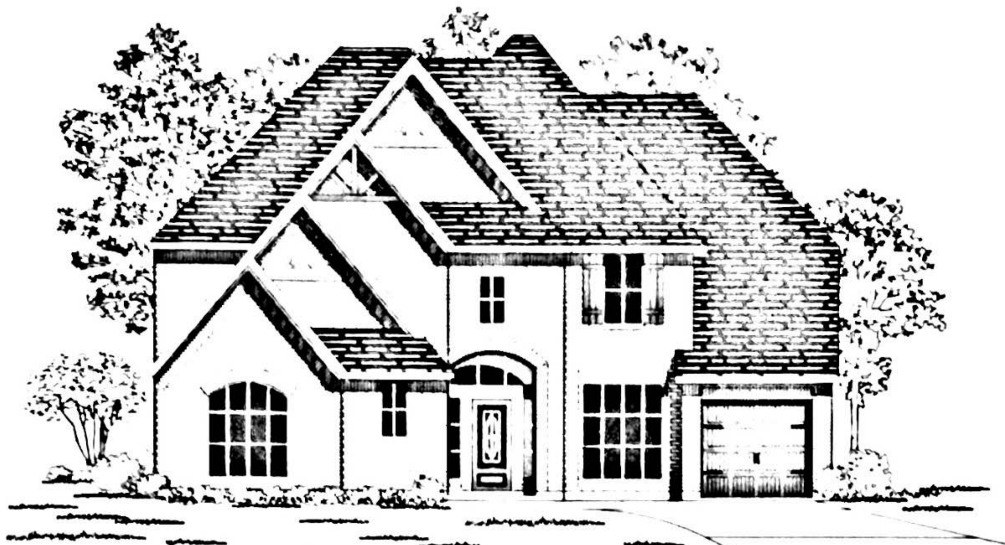
Design 3790W E-1