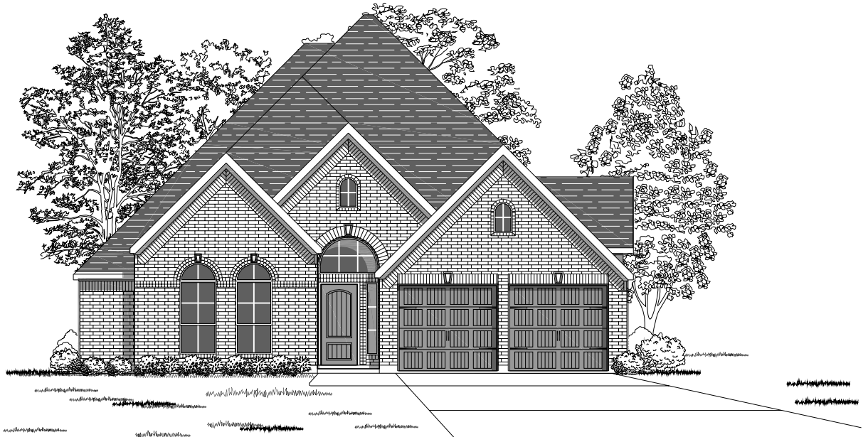
Design 2543W E-1