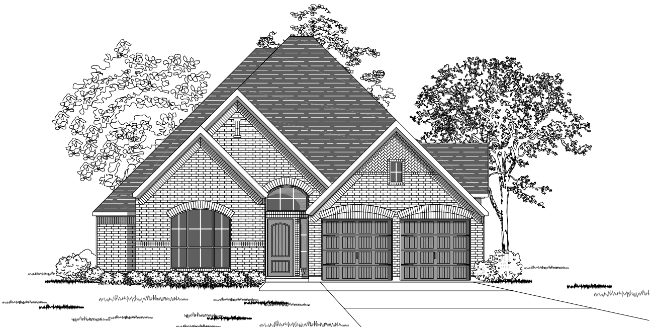
Design 2543W E-2