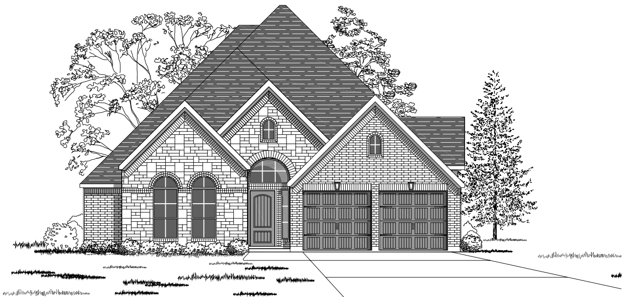
Design 2543W E-50

This design, as originally designed and prior to any changes you make, is estimated to yield approximately the number of square feet shown on page 1. All dimensions are approximate. Square footage may vary based on as-built dimensions, configurations, plan options and/or the method of calculation. Designs are not-to-scale, and are conceptual illustrations that may differ from construction plans or completed improvements. A design may depict features not available on all homesites or in all communities. Perry Homes reserves the right to make changes in plans and specifications, and to substitute material of similar quality. Prices, terms, promotions, plans, dimensions, features, options, amenities, elevations, designs, square footages, specifications, materials, and availability of homes or communities are subject to change without notice or obligation. All obligations will be governed by a written contract. This design does not constitute a commitment to build a particular floor plan or home in any given community. Some floor plans, options, and/or elevations may not be available on certain homesites or in a particular community and may require additional charges. Please check with Perry Homes to verify current offerings in the communities you are considering. This rendering is the property of Perry Homes, LLC. Any reproduction or exhibition is strictly prohibited.