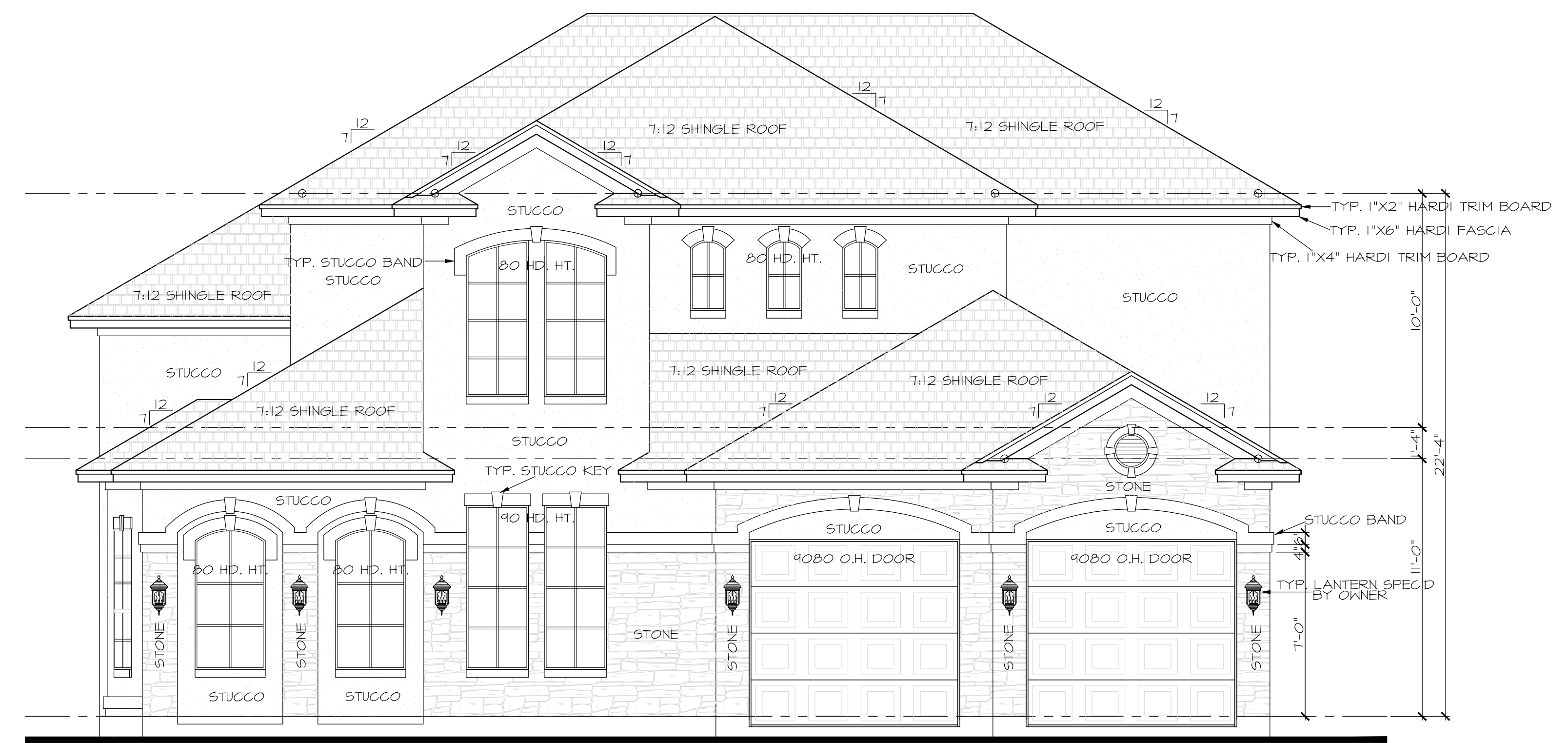
FRONT ELEVATION 1/4"=1'-0"