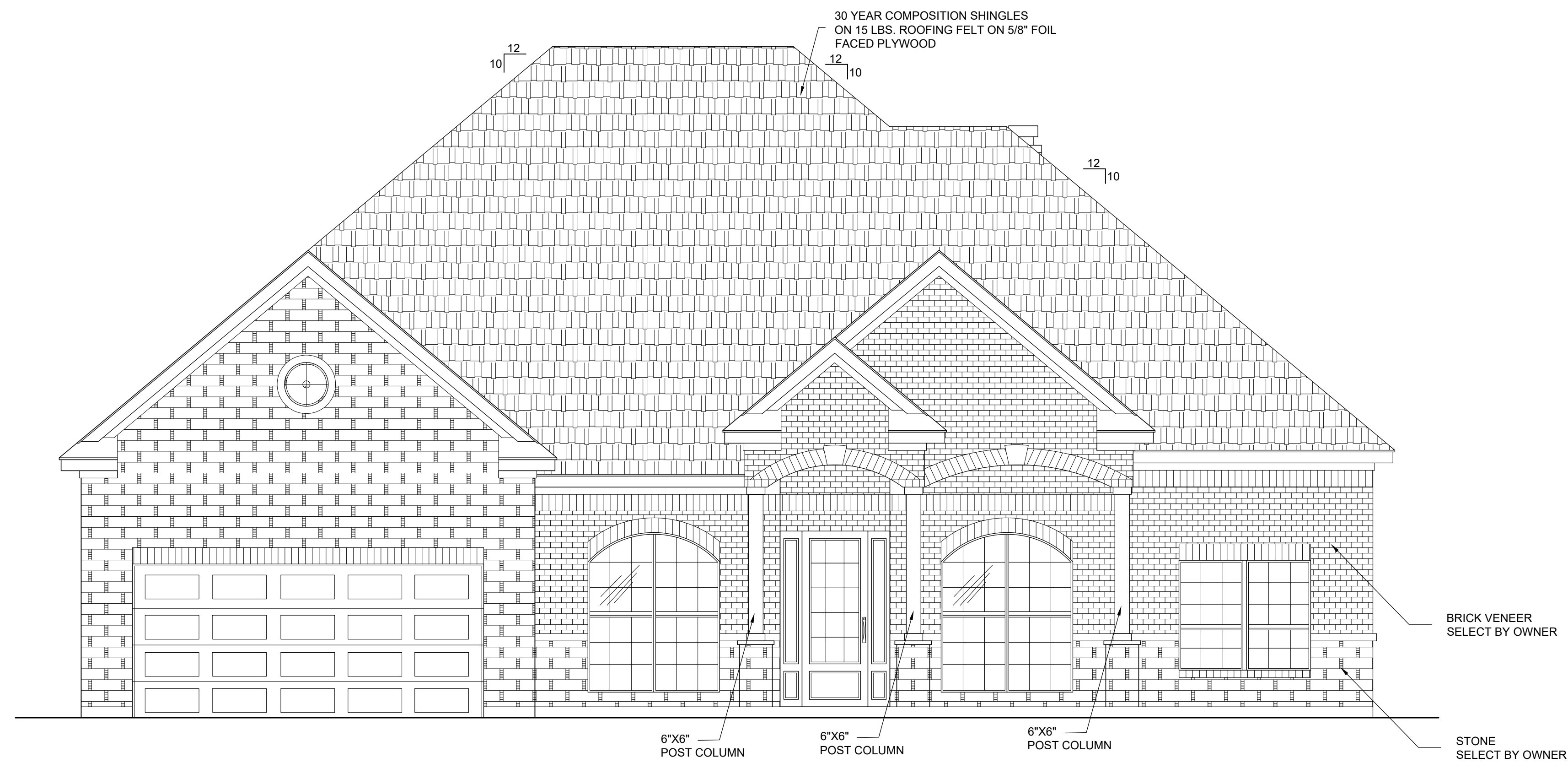
1 FRONT ELEVATION SCALE: 1/4"=1'-0"