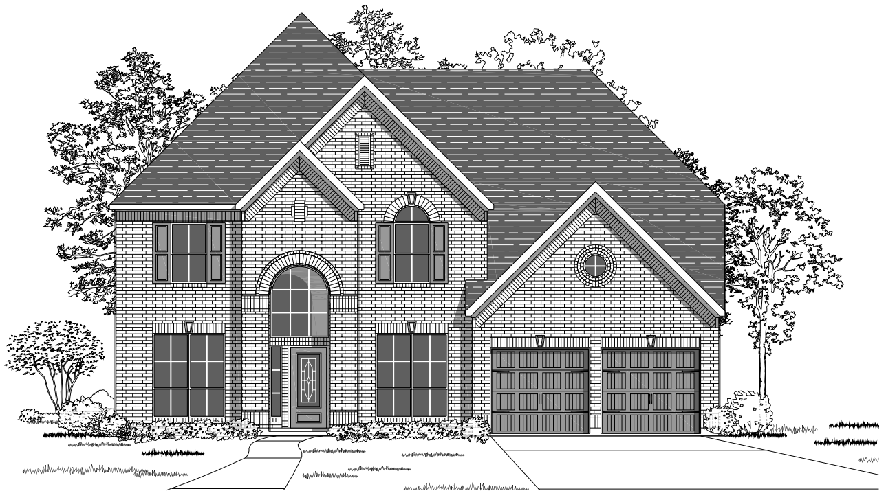
Design 3158W E-2