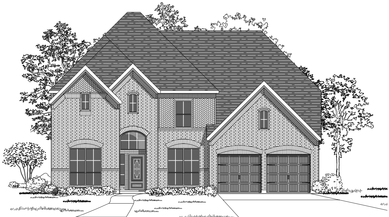
Design 3158W E-4