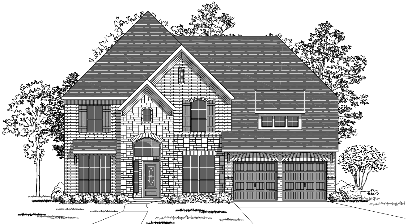
Design 3158W E-70

*See Page 3 for Details and Disclaimers. © Perry Homes, LLC 2016