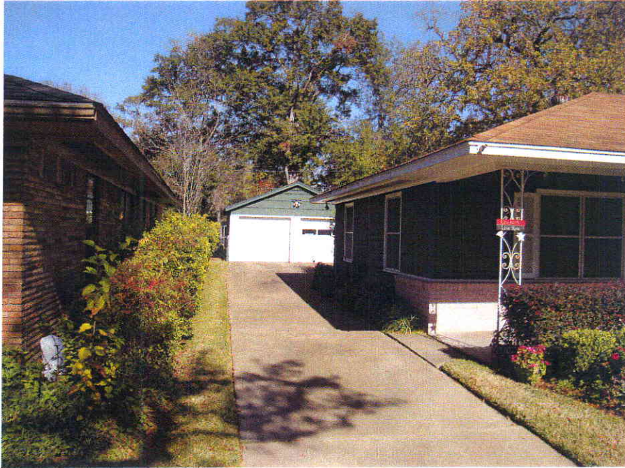
LEFT SIDE VIEW (12/29/2011)