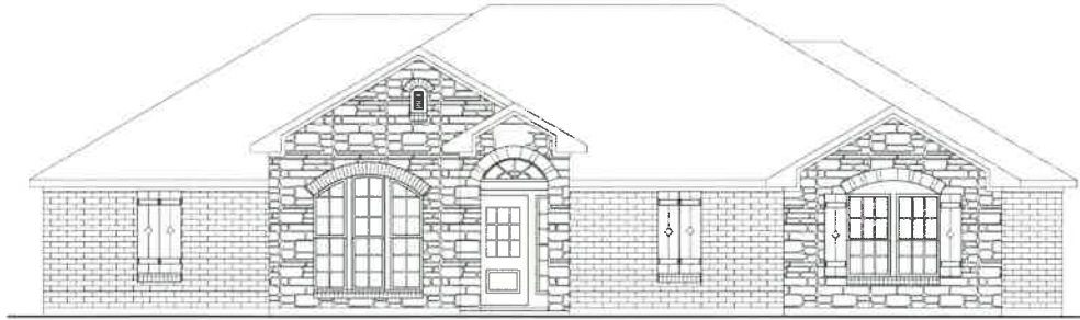
B - 2319 sq.ft. 61'-11"W x 53'-9.5"D