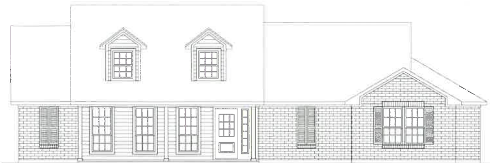
C - 2324 sq.ft. 61'-11"W x 53'-9.5"D