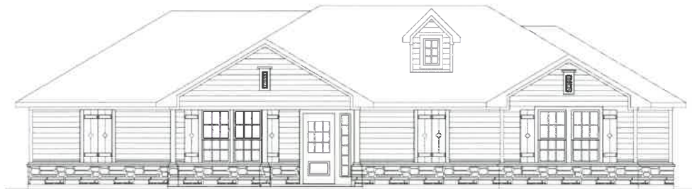
D - 2285 sq.ft. 61'-0"W x 53'-9.5"D

VA, FHA, USDA and Conventional Financing