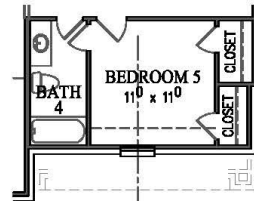
OPT. BEDROOM 5 WITH BATH 4