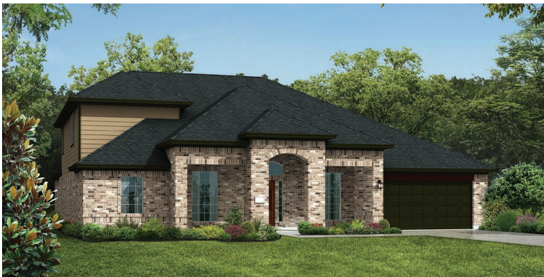
ELEVATION C W/ OPT. GAMEROOM