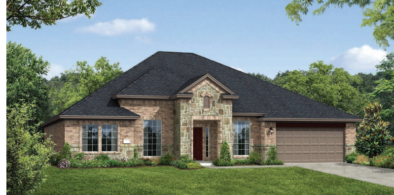
ELEVATION B W/ OPT. STONE