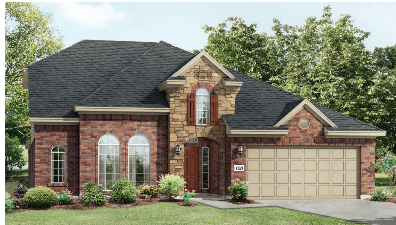
ELEVATION B (SHOWN W/ OPT. STONE)