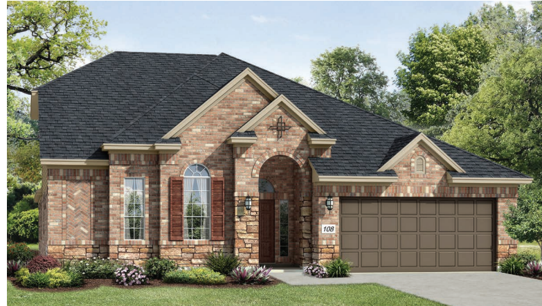
ELEVATION A (SHOWN W/ OPT. STONE)