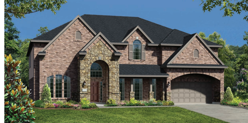
ELEVATION B - SHOWN W/ OPT. STONE