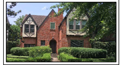
2228 ROBINHOOD STREET

THIS PROPERTY IS IN THE 500 YEAR FLOOD ZONE (REFERENCE FLOOD MAP FOR PARTICULARS).