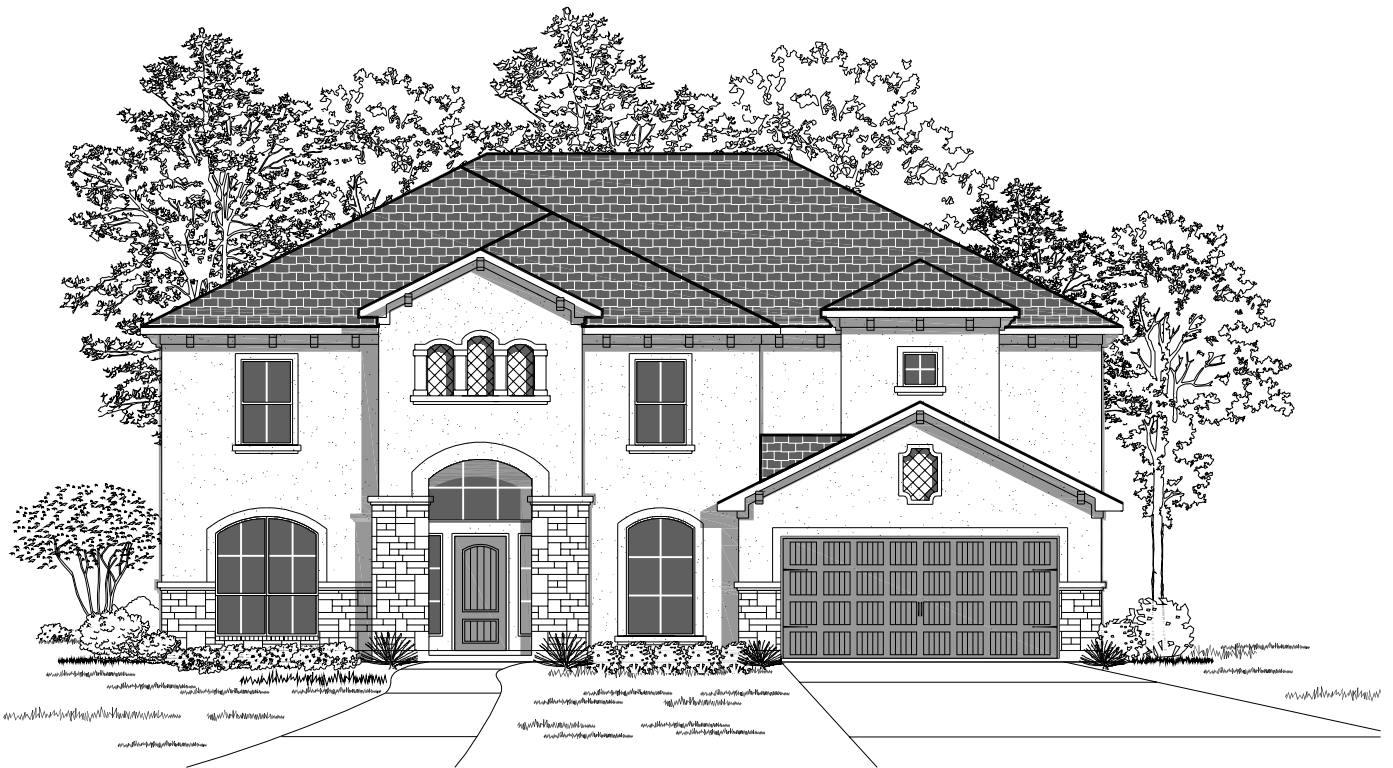
Design 3794M E-2

This design, as originally designed and prior to any changes you make, is estimated to yield approximately the number of square feet shown on page 1. All dimensions are approximate. Square footage may vary based on as-built dimensions, configurations, plan options and/or the method of calculation. Designs are not-to-scale, and are conceptual illustrations that may differ from construction plans or completed improvements. A design may depict features not available on all homesites or in all communities. Perry Homes reserves the right to make changes in plans and specifications, and to substitute material of similar quality. Prices, terms, promotions, plans, dimensions, features, options, amenities, elevations, designs, square footages, specifications, materials, and availability of homes or communities are subject to change without notice or obligation. All obligations will be governed by a written contract. This design does not constitute a commitment to build a particular floor plan or home in any given community. Some floor plans, options, and/or elevations may not be available on certain homesites or in a particular community and may require additional charges. Please check with Perry Homes to verify current offerings in the communities you are considering. This rendering is the property of Perry Homes, LLC. Any reproduction or exhibition is strictly prohibited. © Perry Homes, LLC 2018