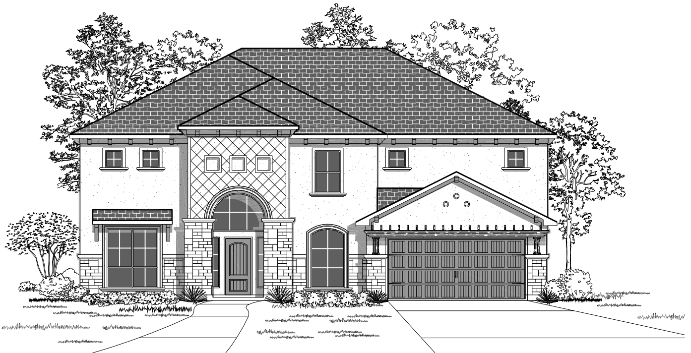
Design 3794M E-1