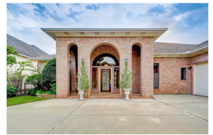
Manned Gates, Double-Wide Circle Driveway & Waterfront Lot