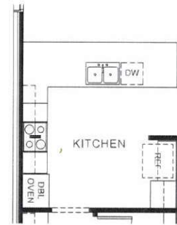
OPTIONAL BUILT-IN KITCHEN