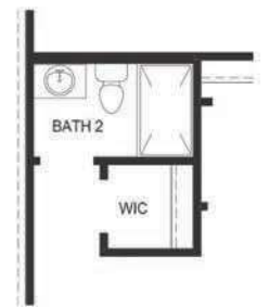
OPTIONAL 36" X 60" SHOWER BATH 2