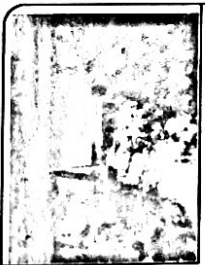
NOTE: THIS IS SUBJECT TO ANY RESTRICTIONS AND/OR ADDITIONAL DOCUMENTATION AND RECORDS.

0.30 ACRE LOT 3 AND PART OF LOTS 4, 11, 12, 13 & 14 BLOCK 7 D. GREGGS SECOND ADDITION IN THE CITY OF HOUSTON, IN HARRIS COUNTY, TEXAS ACCORDING TO THE MAP OR PLAN THEREOF RECORDED IN VOLUME 28, PAGE 465 OF THE DEED RECORDS OF HARRIS COUNTY, TEXAS