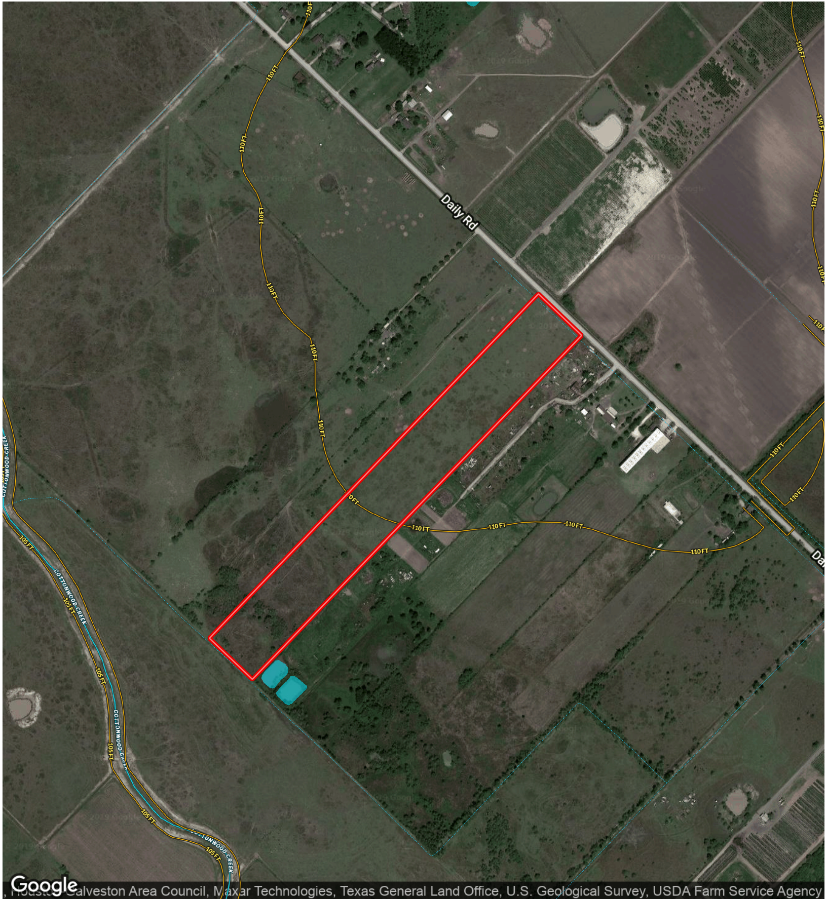
Exhibit A - Property Map