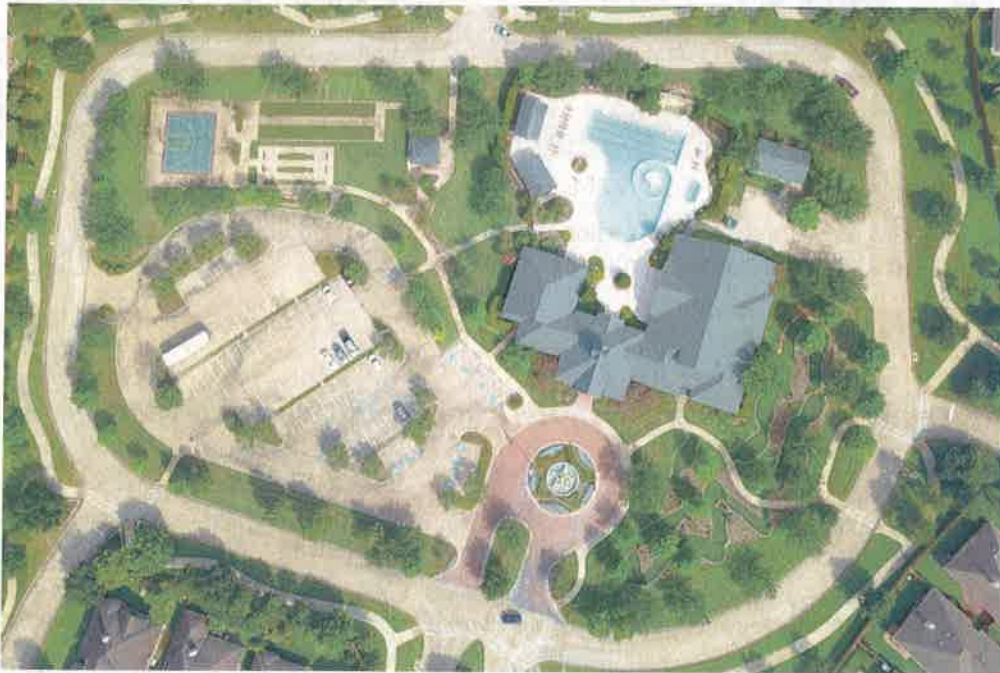
Aerial view of Heritage Circle enclosing common property of Heritage Grand

A monthly HOA assessment fee is required. Please refer to the attached table for the assessment fee amount and a summary of amenities provided by the fee.