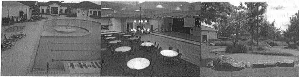
Heated swimming pool