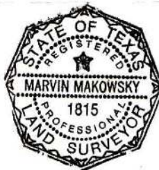
EXHIBIT A, sheet 3 of 3