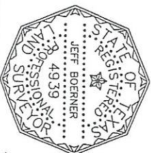
EXHIBIT SHOWING TRACT 13: BEING A 30.03 ACRE TRACT OF LAND LOCATED IN THE J. AROCHA SURVEY, ABSTRACT NO. 1, BELL COUNTY, TEXAS, AND BEING A PORTION OF A CALLED 605.591 ACRE TRACT RECORDED IN VOL. 9835, PG. 512, OFFICIAL PUBLIC RECORDS OF BELL COUNTY, TEXAS.