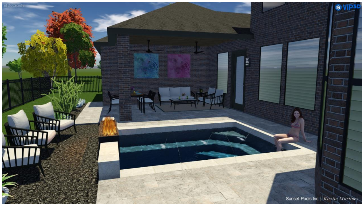
Angle 2 of 5: This design includes travertine decking, a composite wood deck for loungers, a metal fire pit, and black star chip landscape beds with desert-style landscape for a bit of privacy.