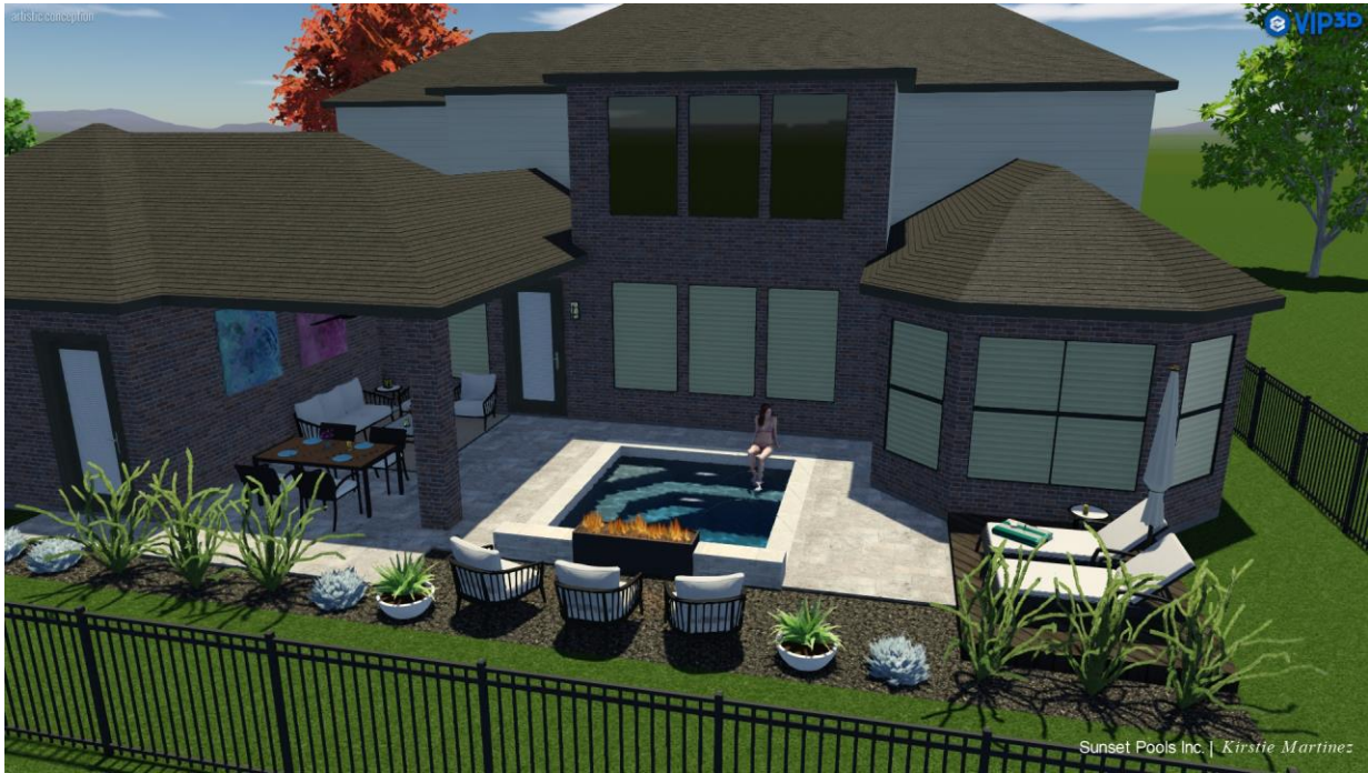
Angle 3 of 5: From here, a view of the back of the house.