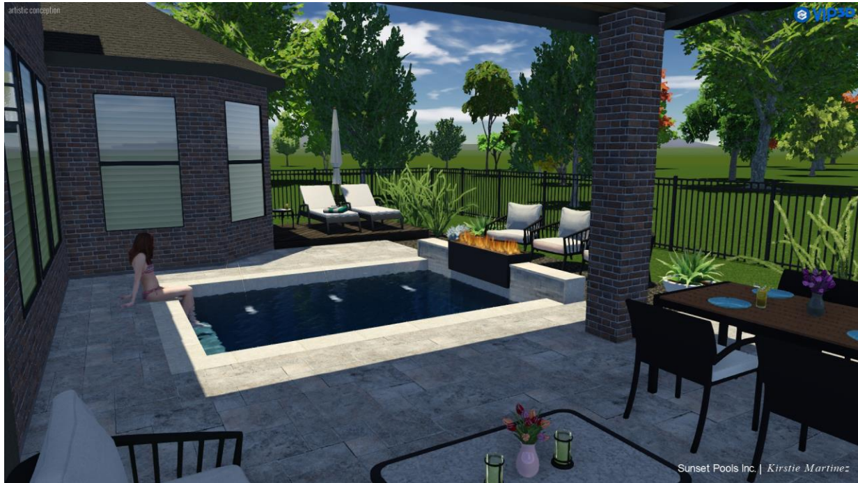
Angle 1 of 5: View from the covered patio. Projected pool size here is 10'X13'3".