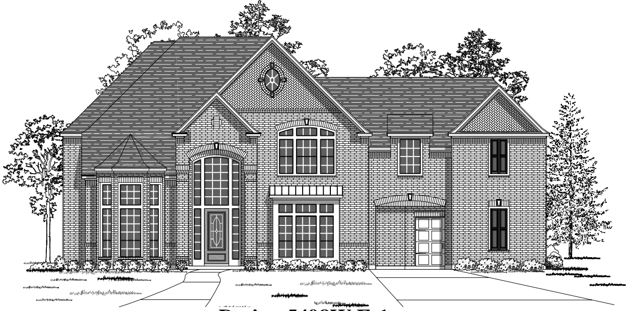
Design 5498W E-1

Some of the elevations shown may not be available in all communities.