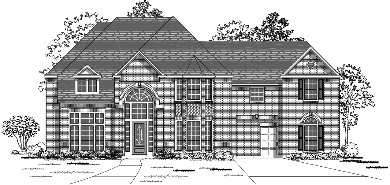
Design 5498W E-2