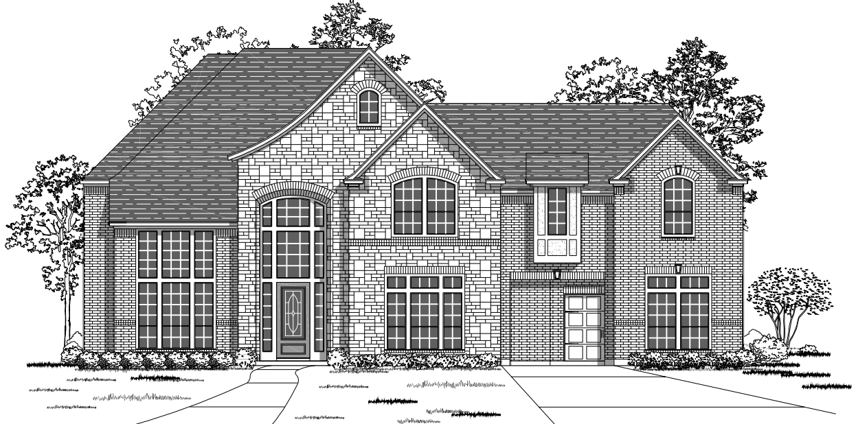
Design 5498W E-30

Elevations subject to change. 09/08/2011 - Perry Homes (80' U)