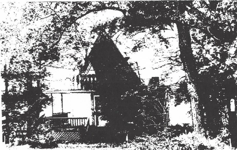
RIGHT FRONT VIEW 4/7/16

If using the Elevation Certificate to obtain NFIP flood insurance, affix at least 2 building photographs below according to the instructions for Item A6. Identify all photographs with date taken; "Front View" and "Rear View"; and, if required, "Right Side View" and "Left Side View." When applicable, photographs must show the foundation with representative examples of the flood openings or vents, as indicated in Section A8. If submitting more photographs than will fit on this page, use the Continuation Page.