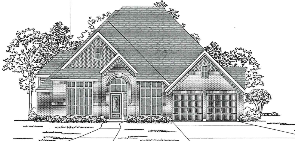
Design 3403W E-1