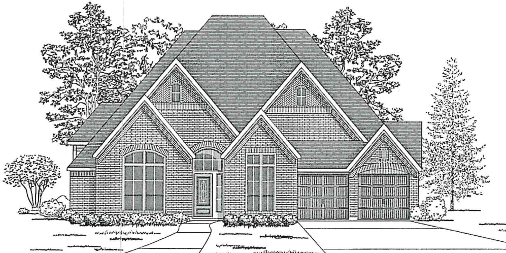
Design 3403W E-31