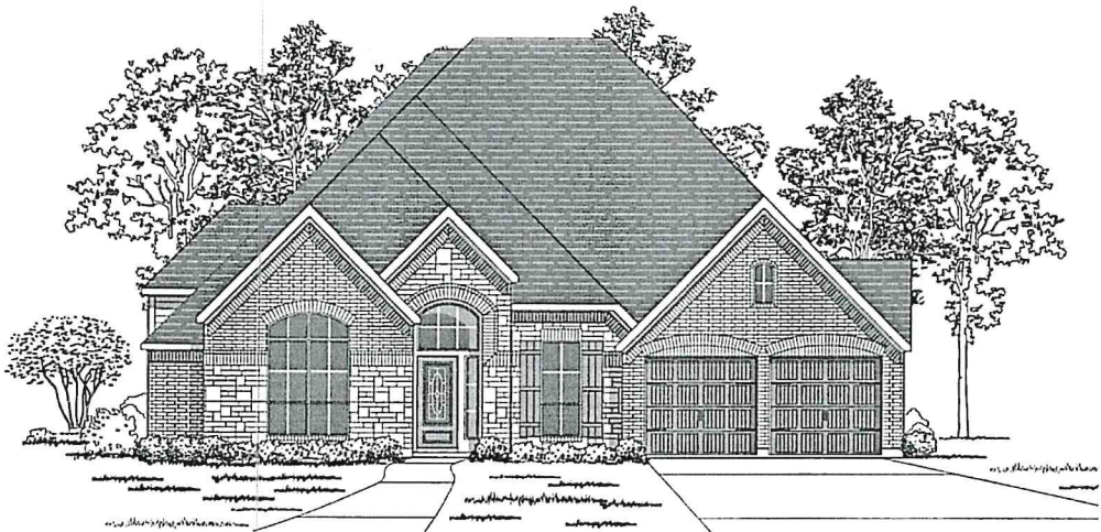
Design 3403W E-30

*See Page 3 for Details and Disclaimers. © Perry Homes, LLC 2012