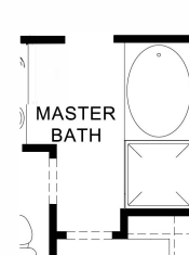
OPTIONAL MASTER BATH SEPARATE TUB & SHOWER

Home and community information, including pricing, included features, terms, availability and amenities, are subject to change and prior sale at any time without notice or obligation. Pictures, photographs, colors, features, and sizes are for illustration purposes only and will vary from the homes as built. Square footage dimensions are approximate. Buyer should conduct his or her own investigation of the present and future availability of school districts and school assignments. D.R. Horton has no control or responsibility for any changes to school districts or school assignments should they occur in the future. 9.25.19