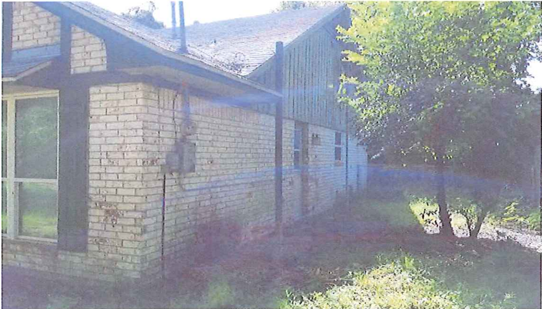
Photo One Caption RIGHT SIDE VIEW - TAKEN 8/11/18

If submitting more photographs than will fit on the preceding page, affix the additional photographs below. Identify all photographs with: date taken; "Front View" and "Rear View"; and, if required, "Right Side View" and "Left Side View." When applicable, photographs must show the foundation with representative examples of the flood openings or vents, as indicated in Section A8.