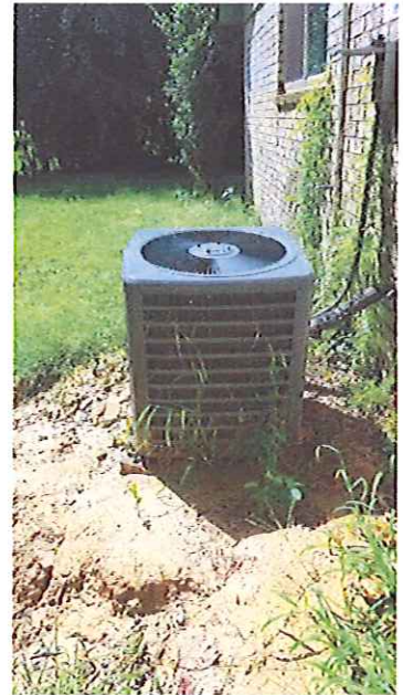
Photo Two Caption LEFT SIDE & AC UNIT VIEW - TAKEN 8/11/18