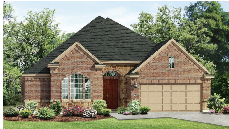
ELEVATION A (SHOWN W/ OPT. STONE)