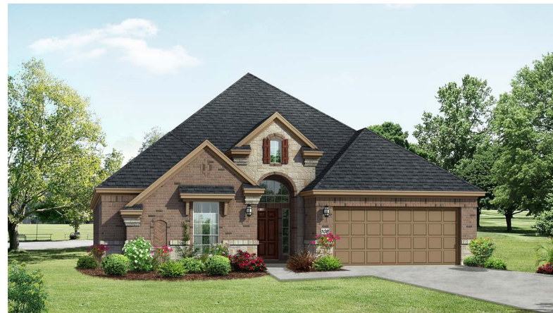
ELEVATION B (SHOWN W/ OPT. STONE)