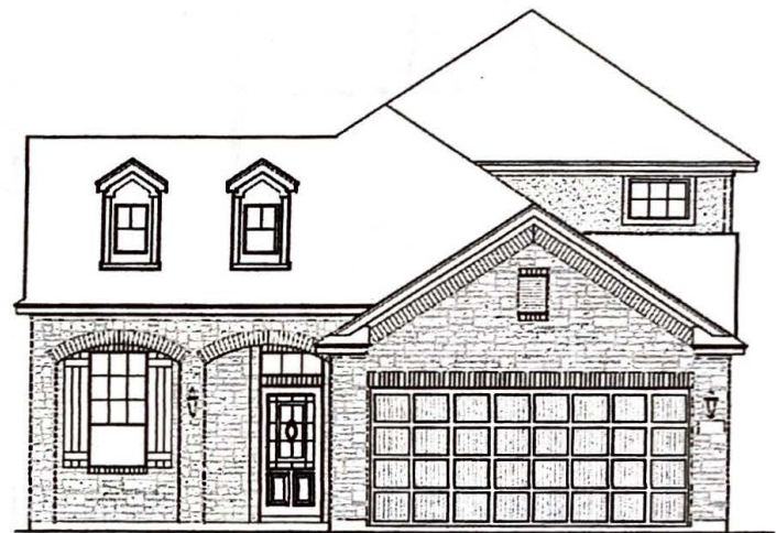
FRONT ELEVATION BS: (STONE VERSION)