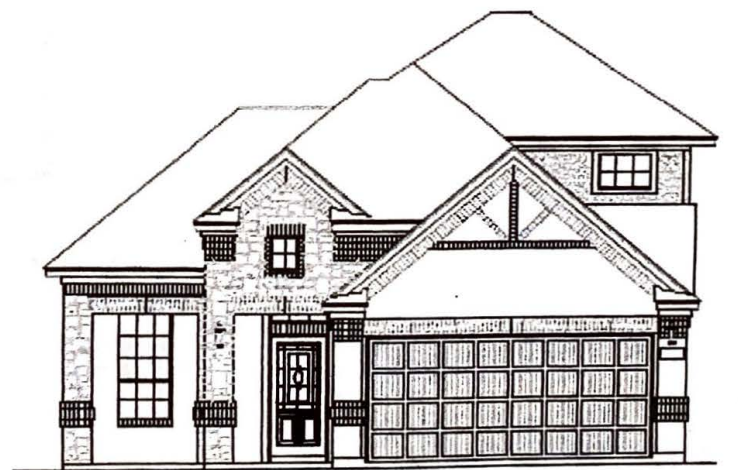
FRONT ELEVATION CS: (STONE VERSION)