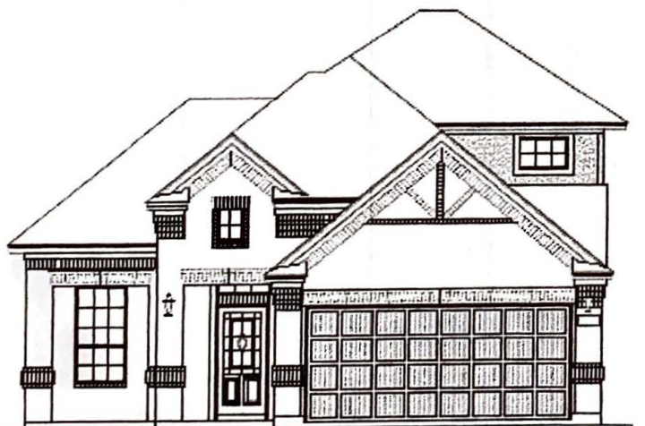
FRONT ELEVATION C