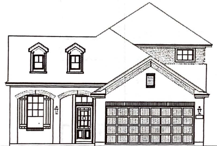
FRONT ELEVATION B