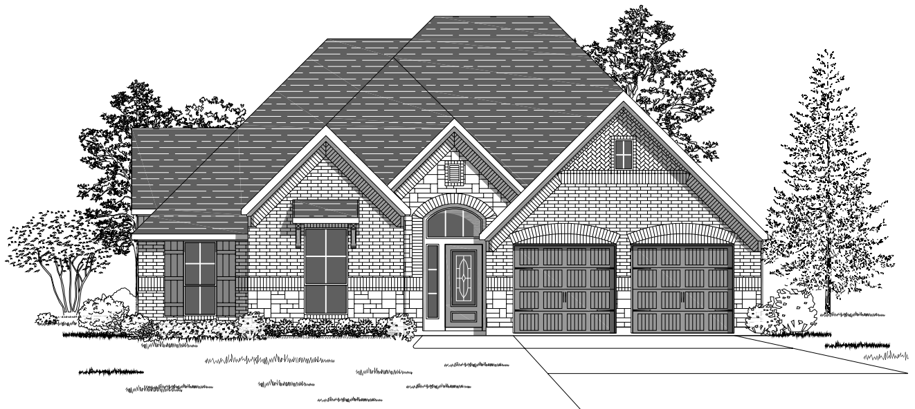
Design 2554W E-30

This design, as originally designed and prior to any changes you make, is estimated to yield approximately the number of square feet shown on page 1. All dimensions are approximate. Square footage may vary based on as-built dimensions, configurations, plan options and/or the method of calculation. Designs are not-to-scale, and are conceptual illustrations that may differ from construction plans or completed improvements. A design may depict features not available on all homesites or in all communities. Perry Homes reserves the right to make changes in plans and specifications, and to substitute material of similar quality. Prices, terms, promotions, plans, dimensions, features, options, amenities, elevations, designs, square footages, specifications, materials, and availability of homes or communities are subject to change without notice or obligation. All obligations will be governed by a written contract. This design does not constitute a commitment to build a particular floor plan or home in any given community. Some floor plans, options, and/or elevations may not be available on certain homesites or in a particular community and may require additional charges. Please check with Perry Homes to verify current offerings in the communities you are considering. This rendering is the property of Perry Homes, LLC. Any reproduction or exhibition is strictly prohibited.