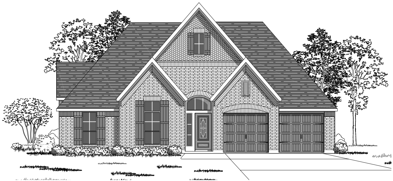
Design 2554W E-31