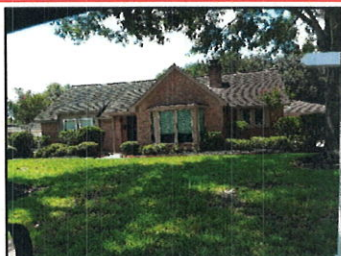
22211 Wetherburn Lane Katy, Texas 77449

ARTHUR LAND SURVEYING 9901 Regal Row, Suite 200 Houston, Texas 77040 Ph. 281.937.2731 - TFRN# 10194357 arthursurveying.com Established 1986