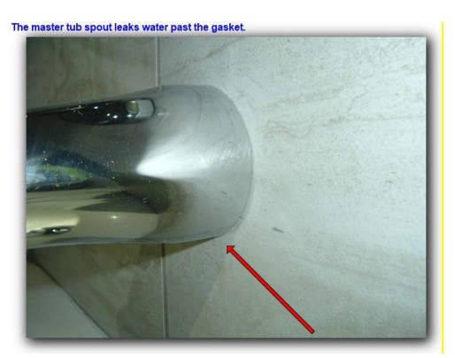
Page 6 of 14