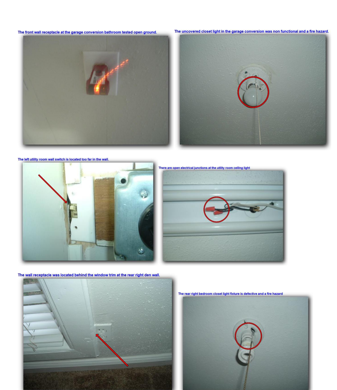
Page 11 of 14