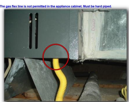
Page 13 of 14