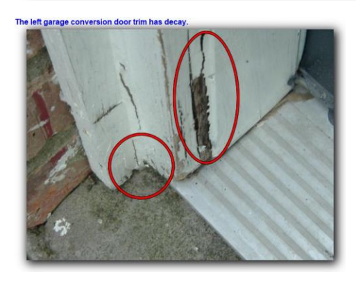
Page 4 of 14