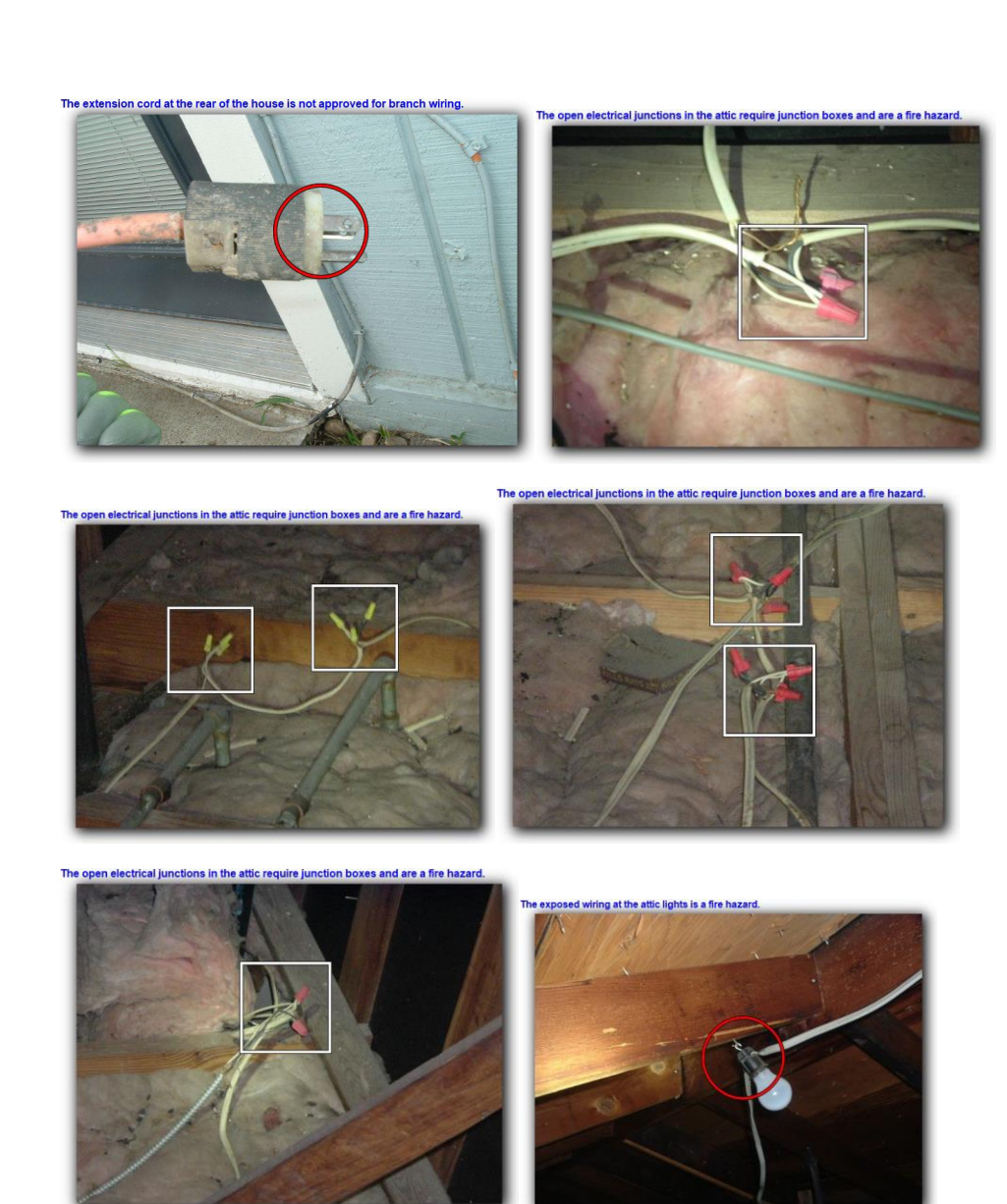
Page 12 of 14