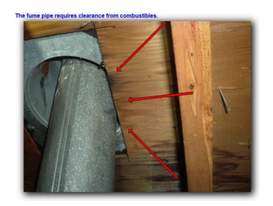
Page 14 of 14