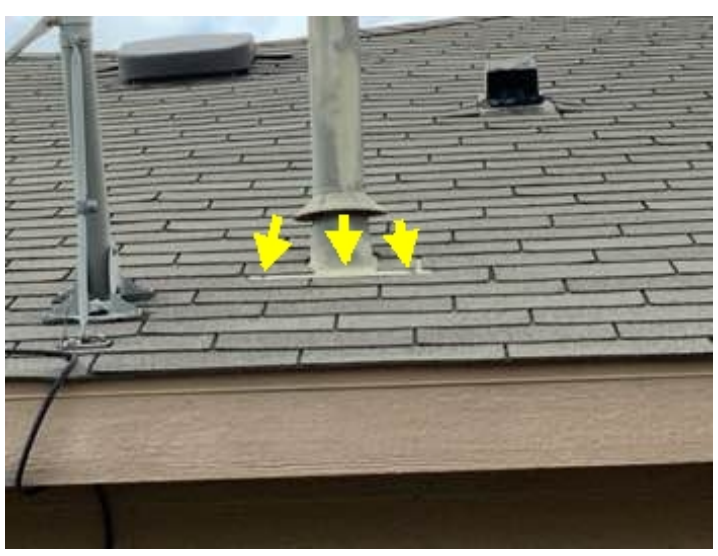
Exposed nail heads on the vent flashing.