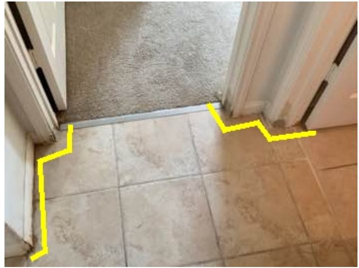
Moisture damage on the baseboards outside the left front guest bedroom. Moisture damaged trim at the front guest bedroom and bathroom doors.