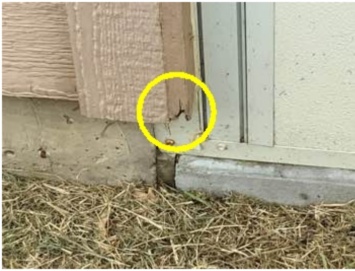
Damaged trim on the right rear corner of this home.