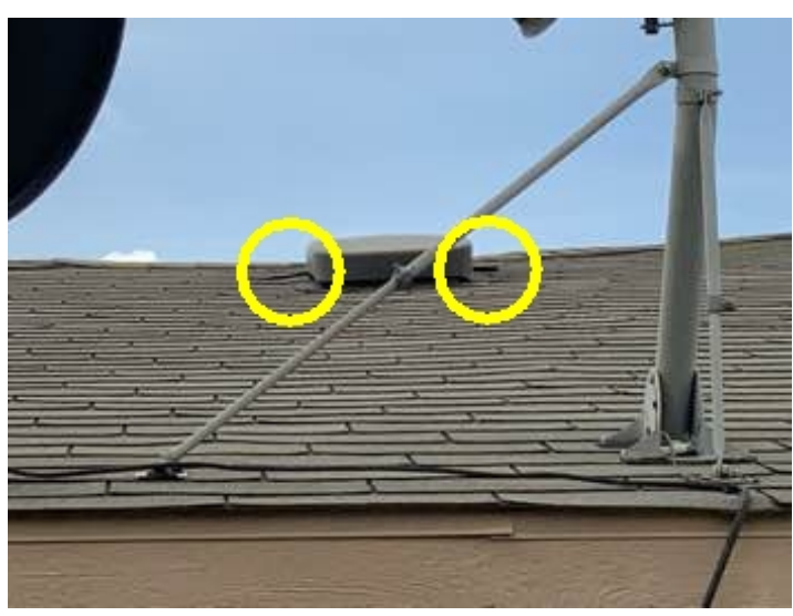
More lifting shingles on the right side of this home.