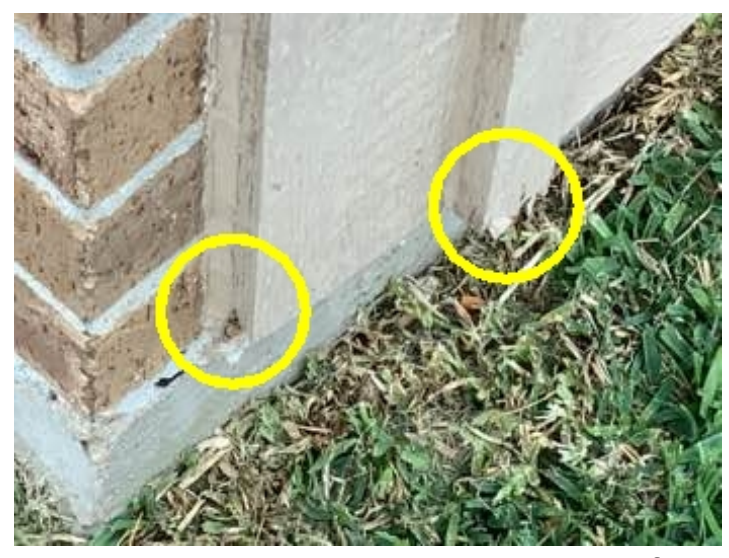
Damaged and deteriorating trim on the right front Damaged and deteriorating casing at the garage corner of this home.