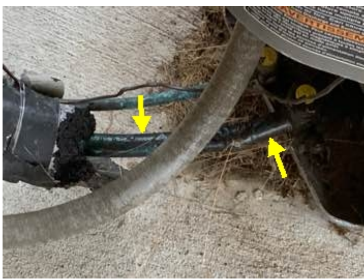
Damaged and deteriorating condensing unit cabinet.