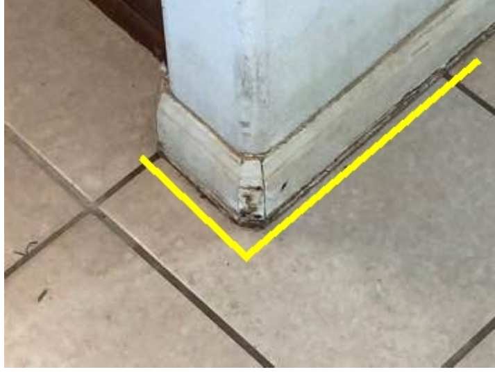
Moisture damage on the baseboards in the kitchen.