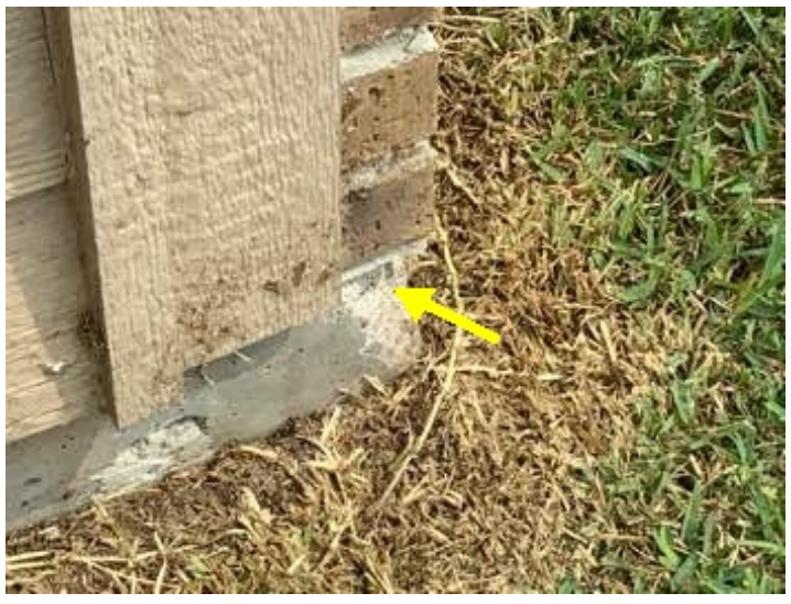
Corner pop on the left front corner of this home.