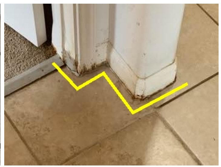
Moisture damage on the baseboards outside the left rear guest bedroom.