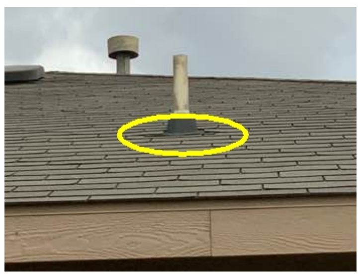
Lifting vent boot flashing on the left side of this home.