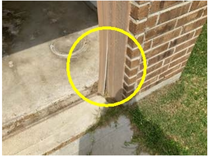
Loose trim on the right side of the garage door.