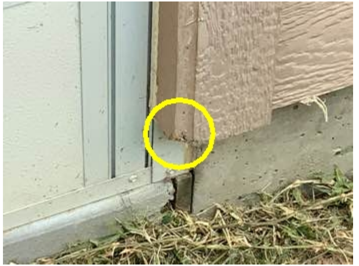
Damaged trim on the left rear corner of this home.