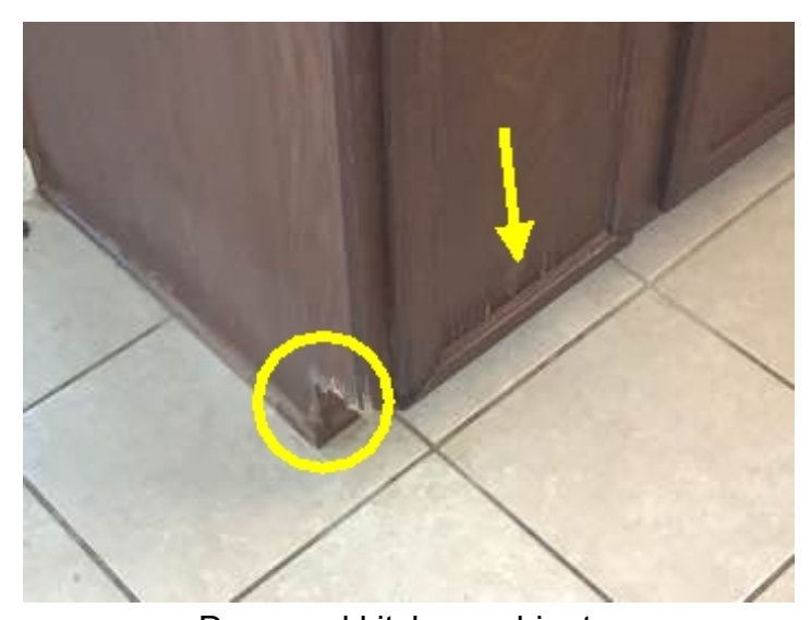
Damaged kitchen cabinets.