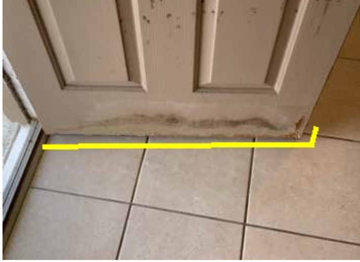
Moisture damaged front guest bedroom door.