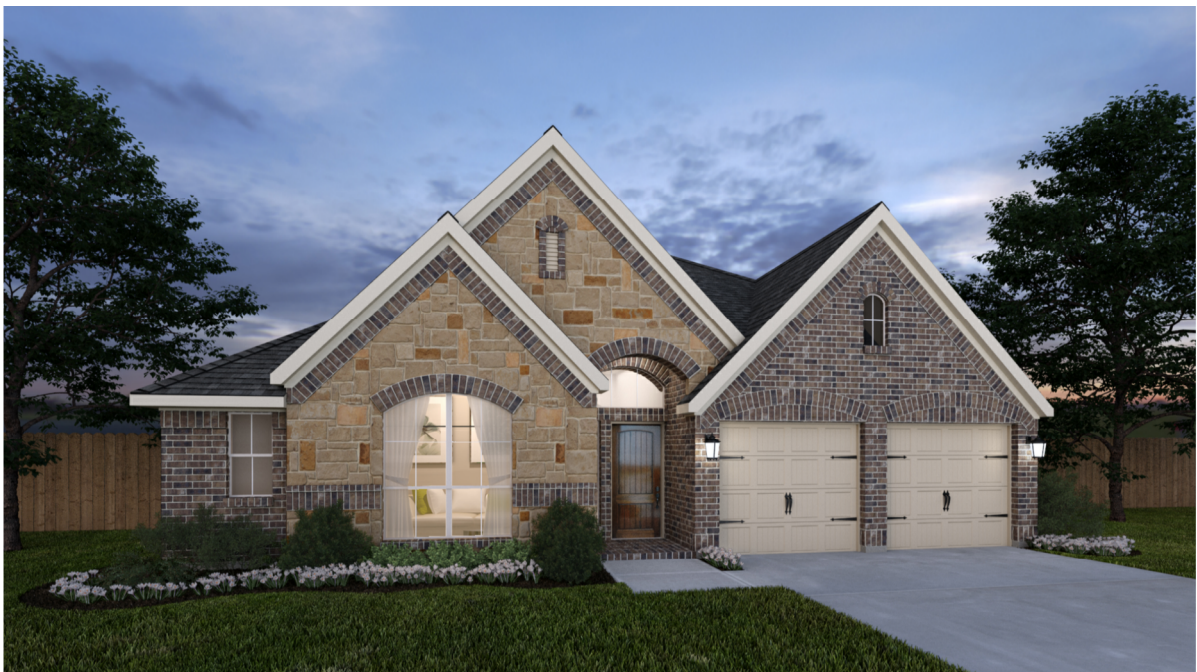
Design 2582W E-54

*See Page 3 for Details and Disclaimers. © Perry Homes, LLC 2019