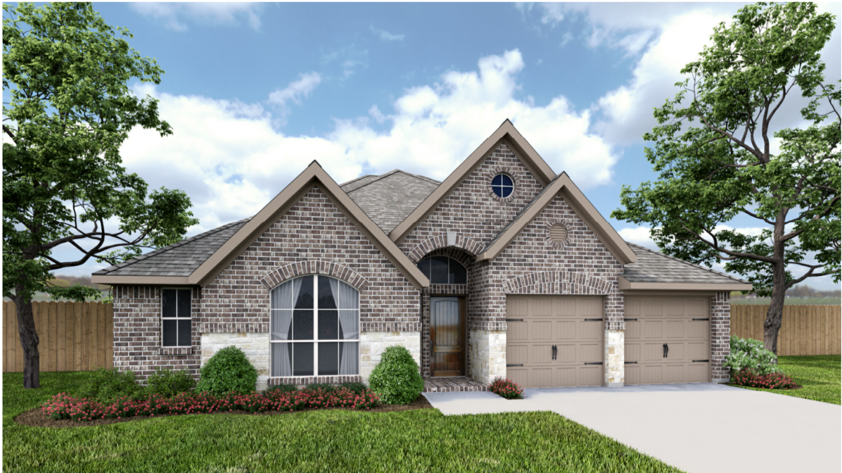
Design 2582W E-33