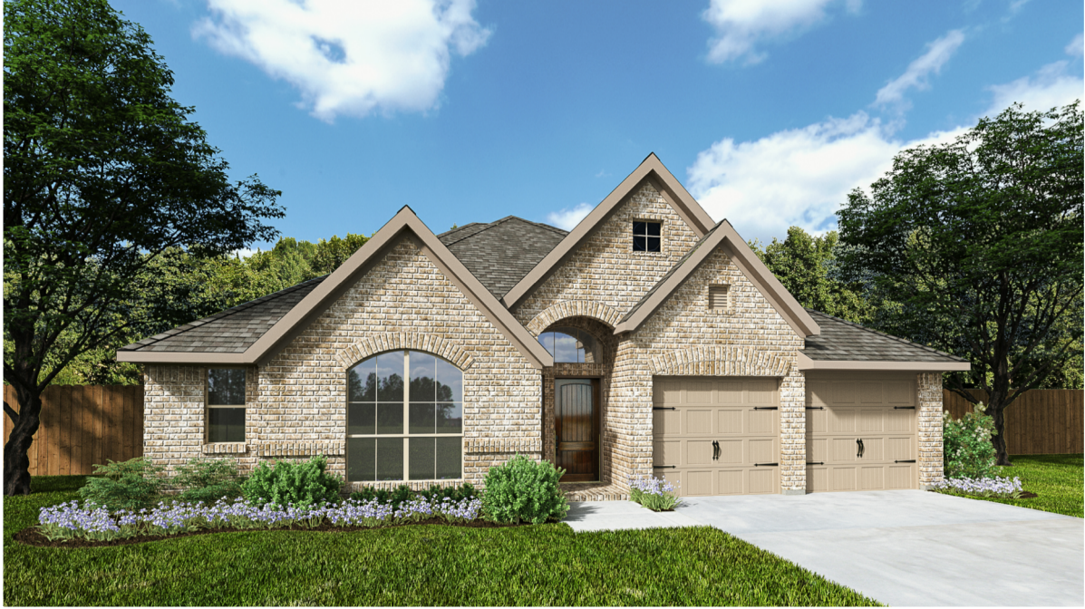
Design 2582W E-1