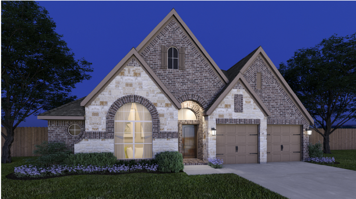
Design 2582W E-72

This design, as originally designed and prior to any changes you make, is estimated to yield approximately the number of square feet shown on page 1. All dimensions are approximate. Square footage may vary based on as-built dimensions, configurations, plan options and/or the method of calculation. Designs are not-to-scale, and are conceptual illustrations that may differ from construction plans or completed improvements. A design may depict features not available on all homesites or in all communities. Perry Homes reserves the right to make changes in plans and specifications, and to substitute material of similar quality. Prices, terms, promotions, plans, dimensions, features, options, amenities, elevations, designs, square footages, specifications, materials, and availability of homes or communities are subject to change without notice or obligation. All obligations will be governed by a written contract. This design does not constitute a commitment to build a particular floor plan or home in any given community. Some floor plans, options, and/or elevations may not be available on certain homesites or in a particular community and may require additional charges. Please check with Perry Homes to verify current offerings in the communities you are considering. This rendering is the property of Perry Homes, LLC. Any reproduction or exhibition is strictly prohibited. © Perry Homes, LLC 2019