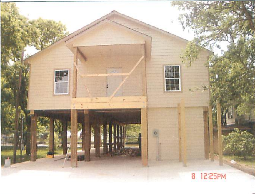
FRONT VIEW (4-8-08)

If using the Elevation Certificate to obtain NFIP flood insurance, affix at least two building photographs below according to the instructions for Item A6. Identify all photographs with: date taken; "Front View" and "Rear View"; and, if required, "Right Side View" and "Left Side View." If submitting more photographs than will fit on this page, use the Continuation Page, following.