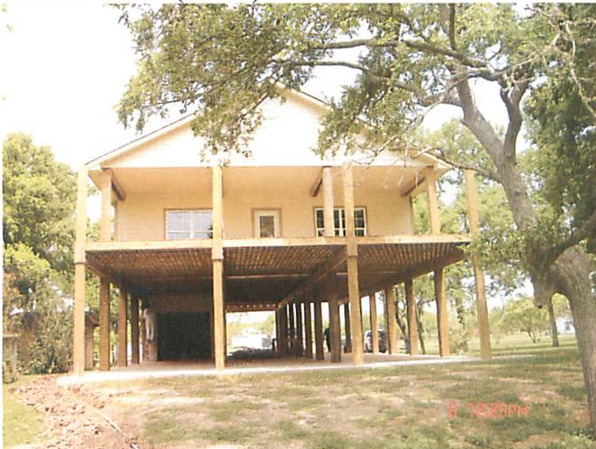
REAR VIEW (4-8-08)