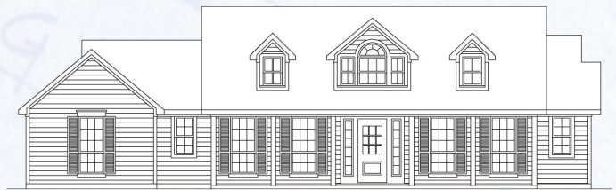
E - 1855 sq.ft. 59' - 0" W x 43' - 4" D

VA, FHA, USDA and Conventional Financing