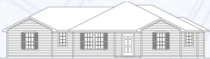
B - 1772 sq.ft. 59' - 0" W x 38' - 8" D