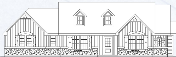
D - 1805 sq.ft. 59' - 5.5" W x 38' - 9.5" D