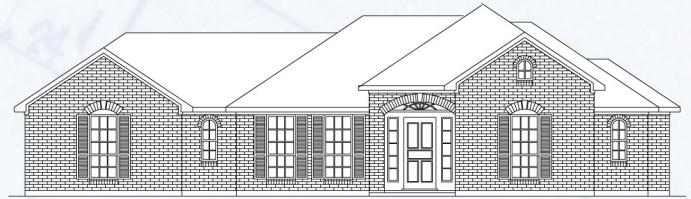
C - 1844 sq.ft. 59' - 11" W x 39' - 1.5" D